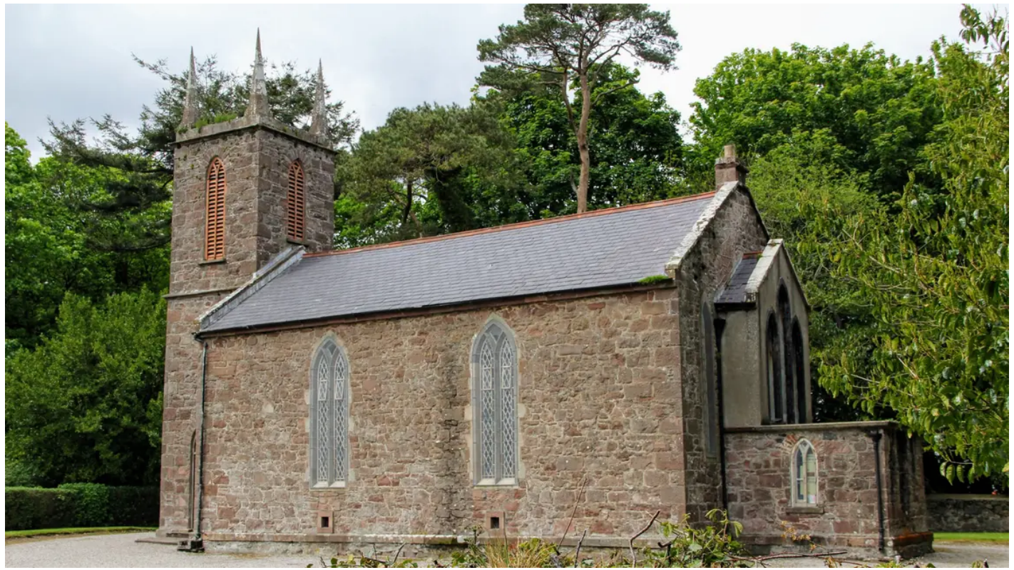
After 13 years of campaigning and fundraising by local people, The Old Church Centre has opened in Cushendun, County Antrim.

The old church building was runner-up in the BBC Restoration series in 2006.