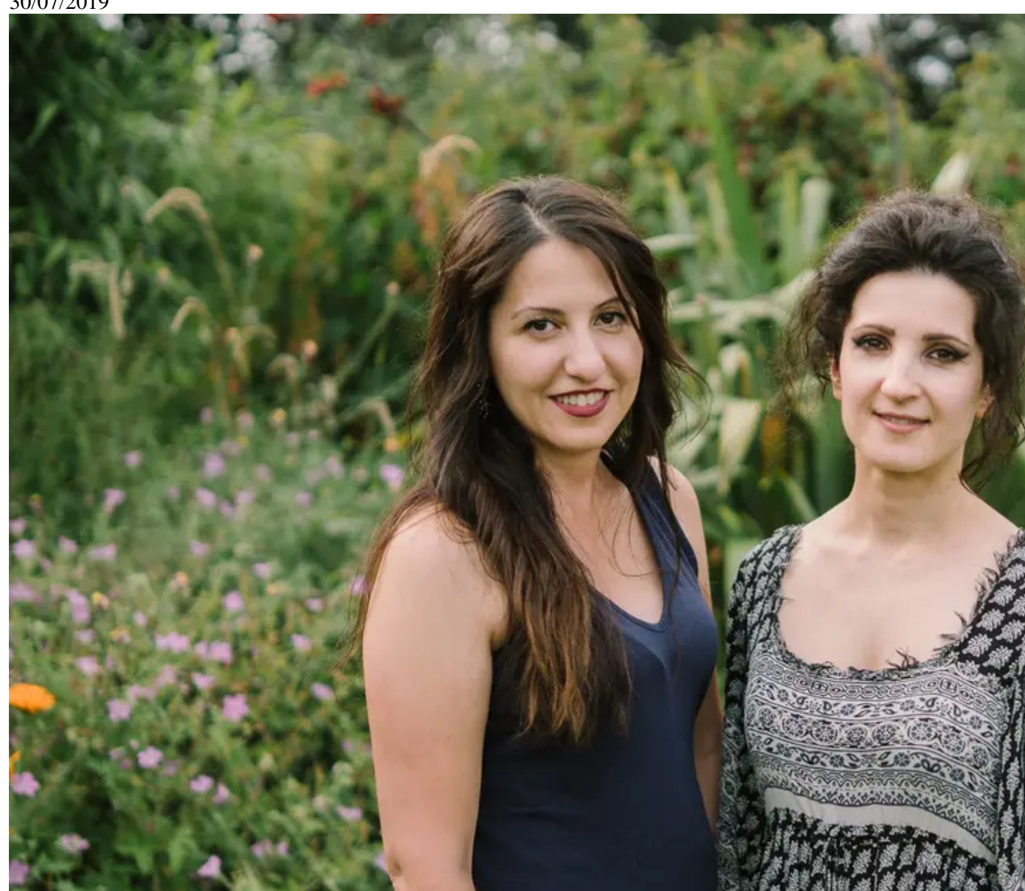
Getting involved in heritage can be a great way to make friends. Those who have, tell us what a difference it has made to their lives.