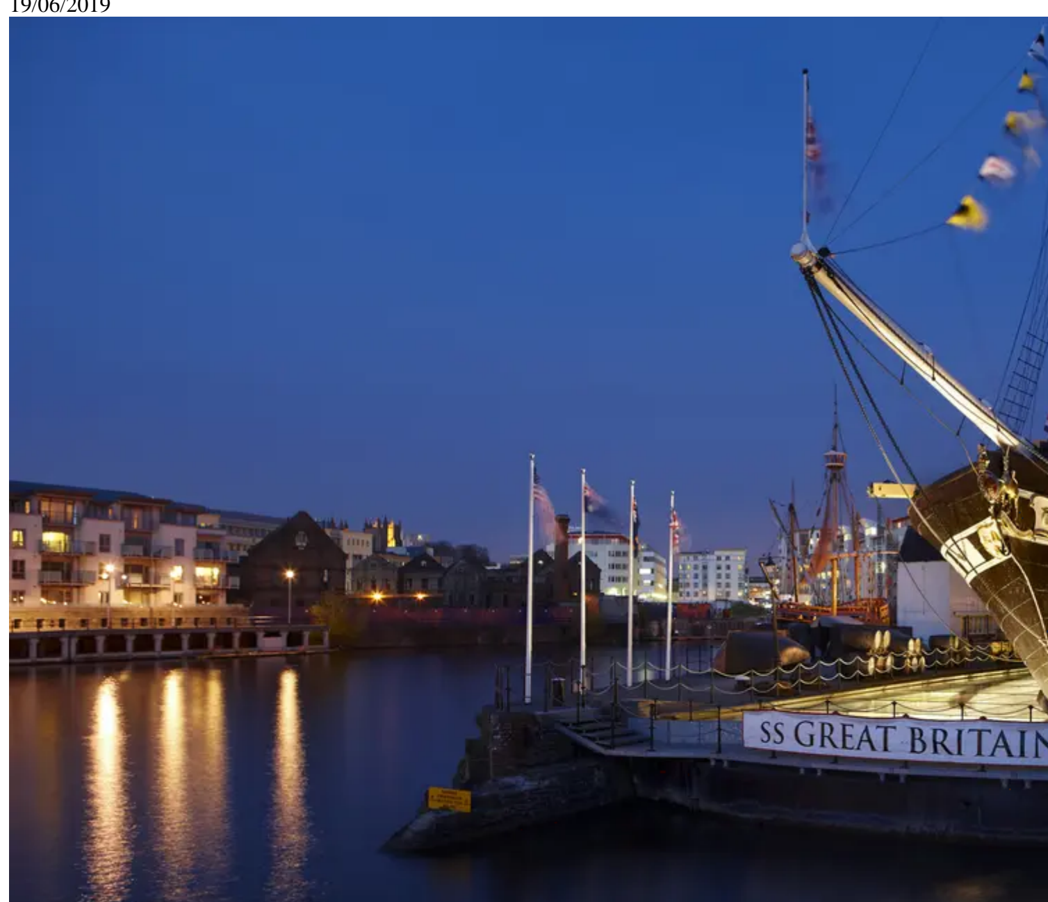
We will invest £100million over the next three years in ambitious, innovative and transformational projects that will revolutionise UK heritage.