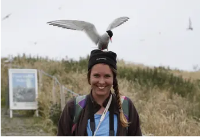
A Little tern says hello to a Coast Care volunteer Northumberland Coast AONB