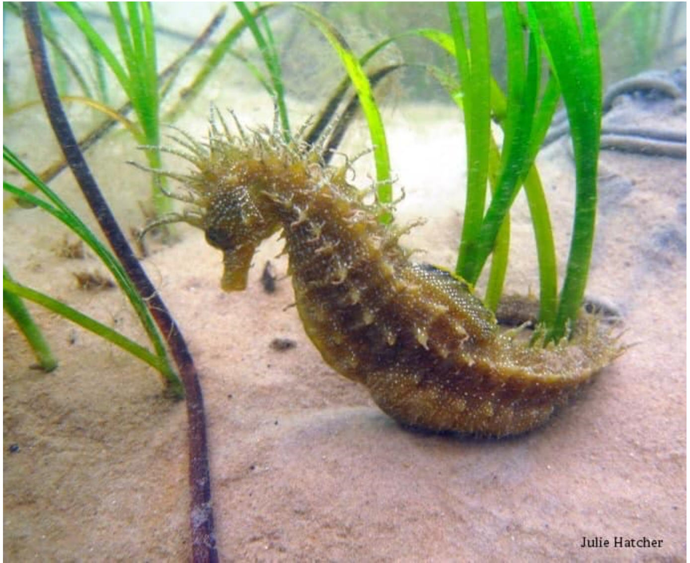
Seahorse.