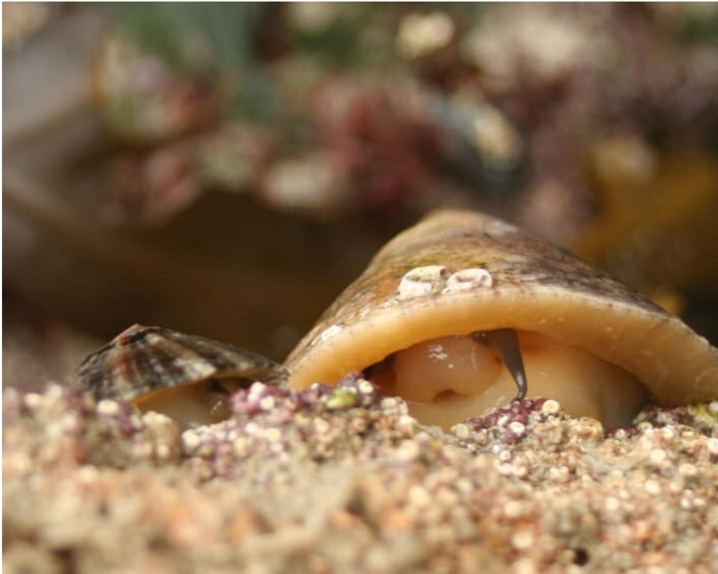
Limpets and other molluscs.