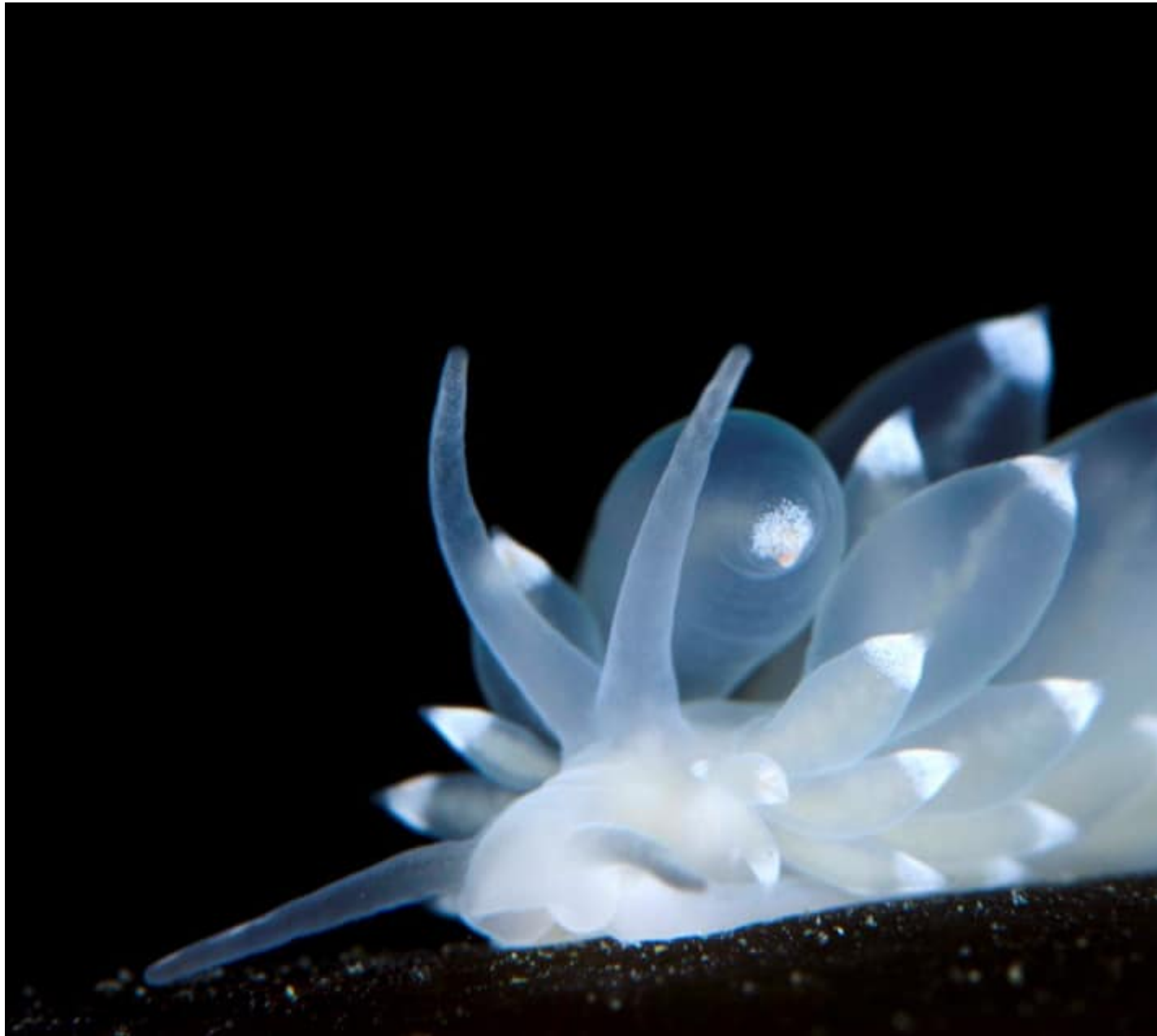
Nudibranch sea slug.