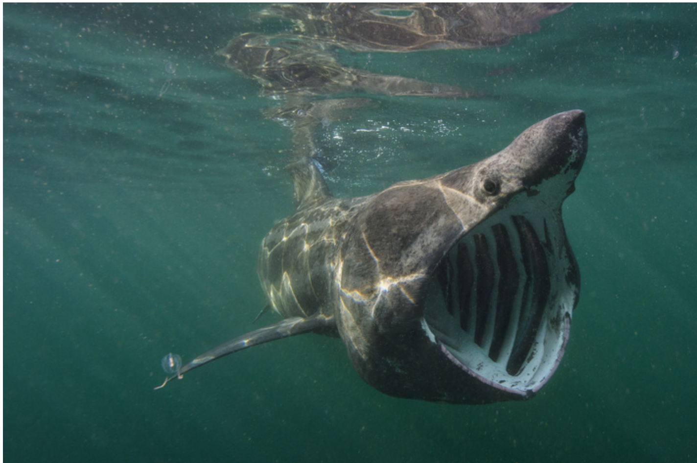
Basking shark.