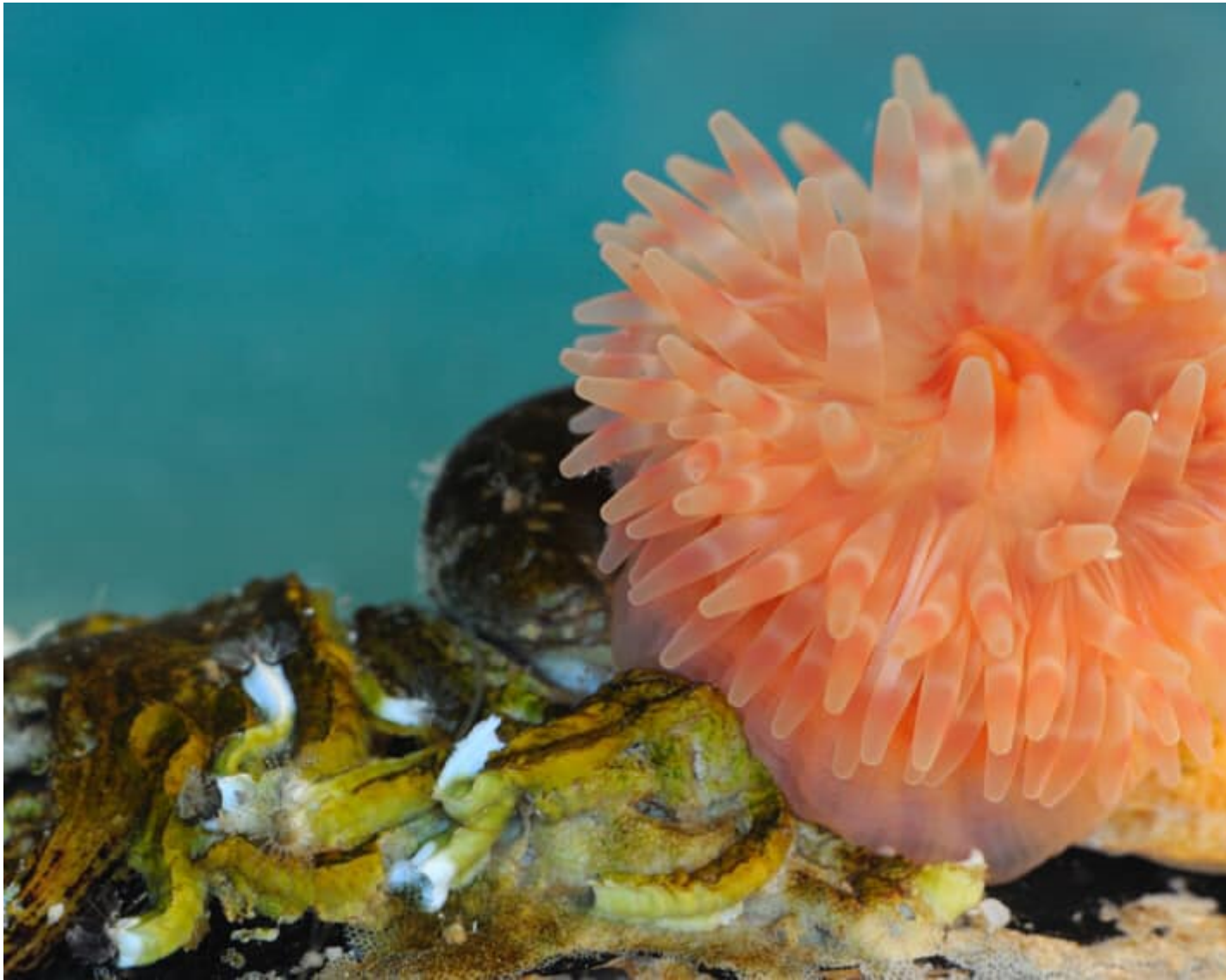
Sea anemone.