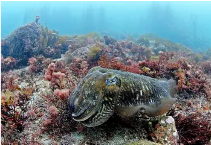
with National Lottery support