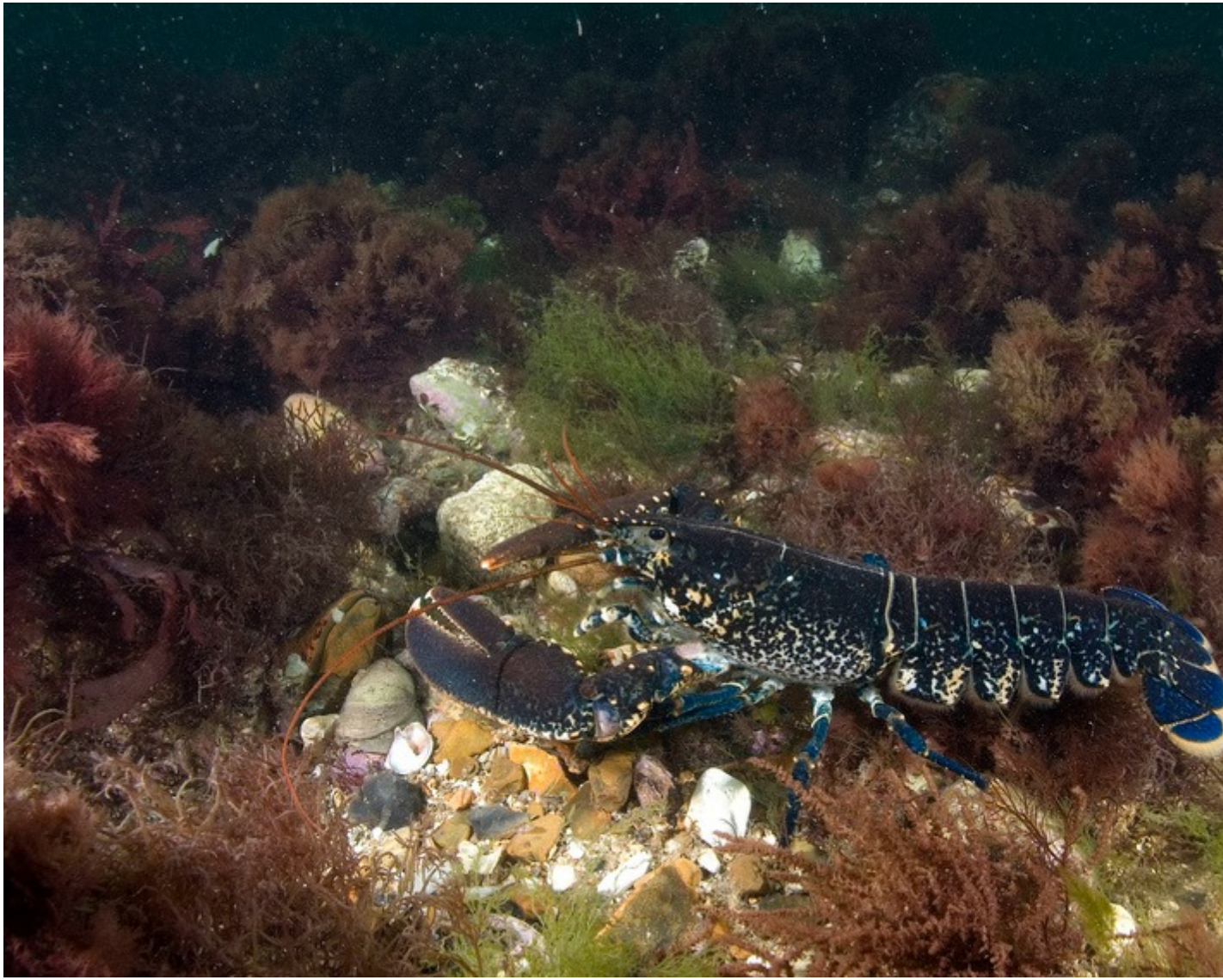
Lobster.