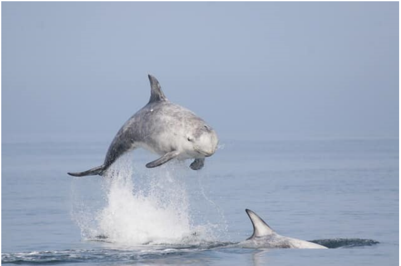
Risso's Dolphin.

Risso's Dolphins have no teeth in their upper jaw and can swallow their squid prey whole.