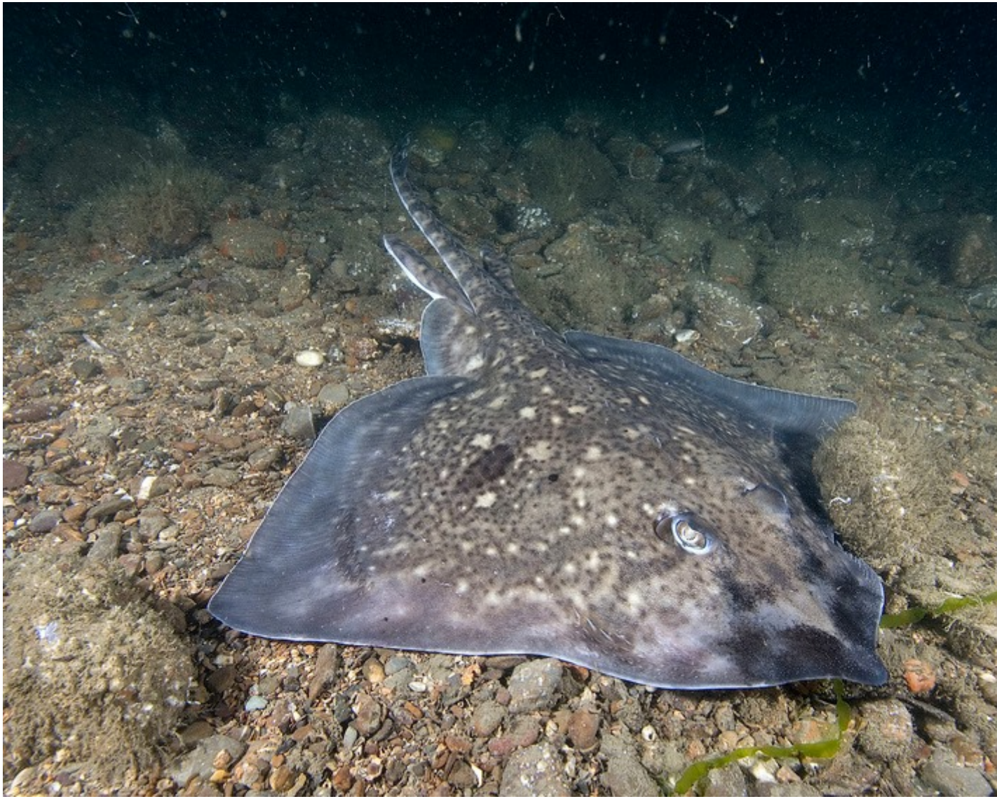
Thornback Ray.