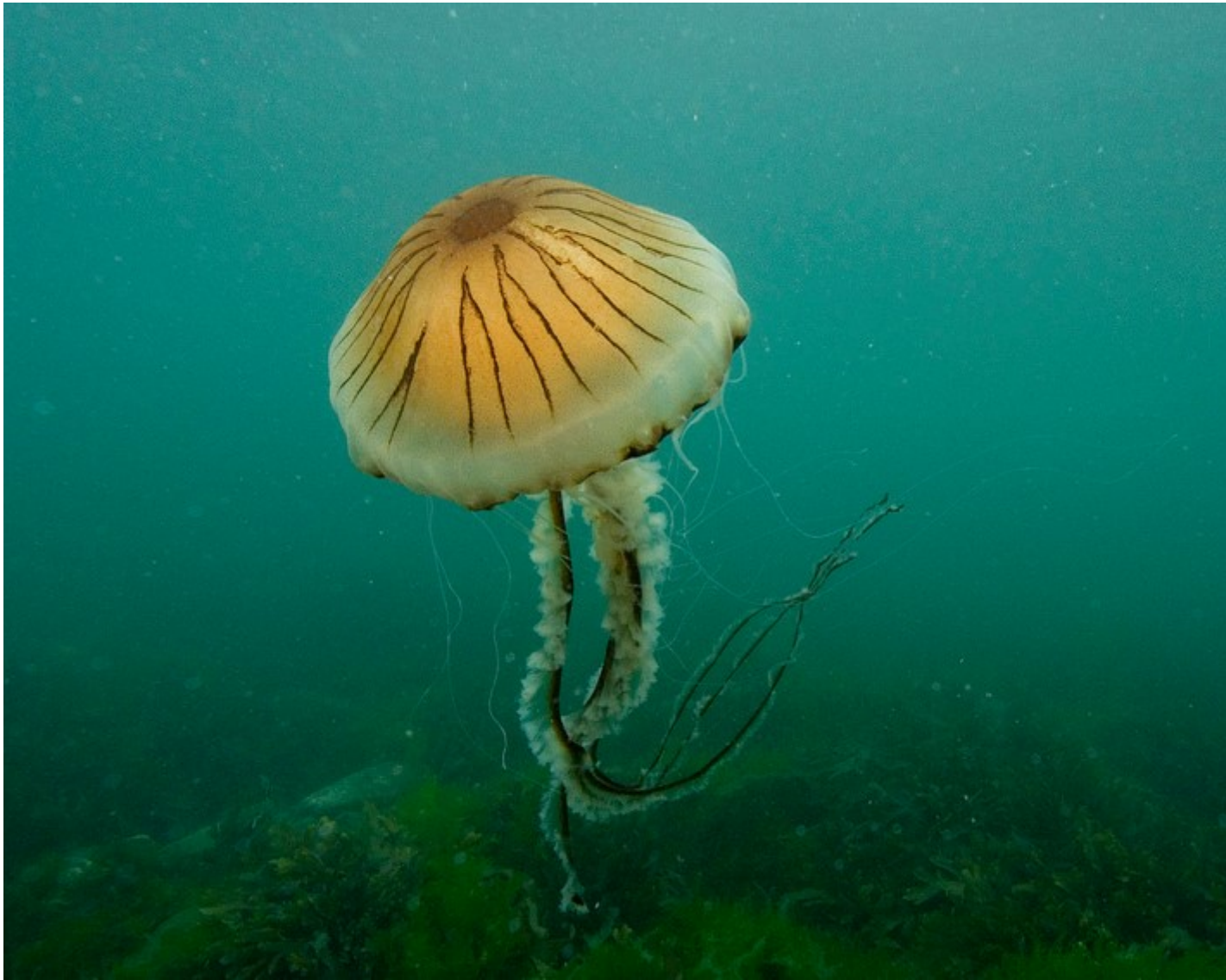
Compass jellyfish.