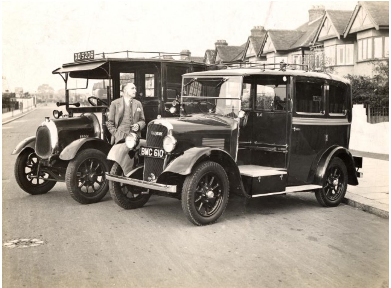
Vintage taxis.

Taxis have been in London since the reign of Queen Elizabeth I. Today they are firmly part of the city's landscape. Our Sherbet Dab project interviewed London cabbies on everything from the black cab to the challenges of learning "The Knowledge" of the streets and the advent of satnav.