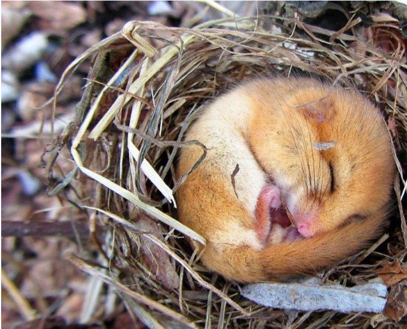
Hazel dormouse.

Back on Our Map (BOOM) is a four-year, University of Cumbria-led project fighting to save the future for the hazel dormouse, Duke of Burgundy butterfly and small blue butterfly in South Cumbria.