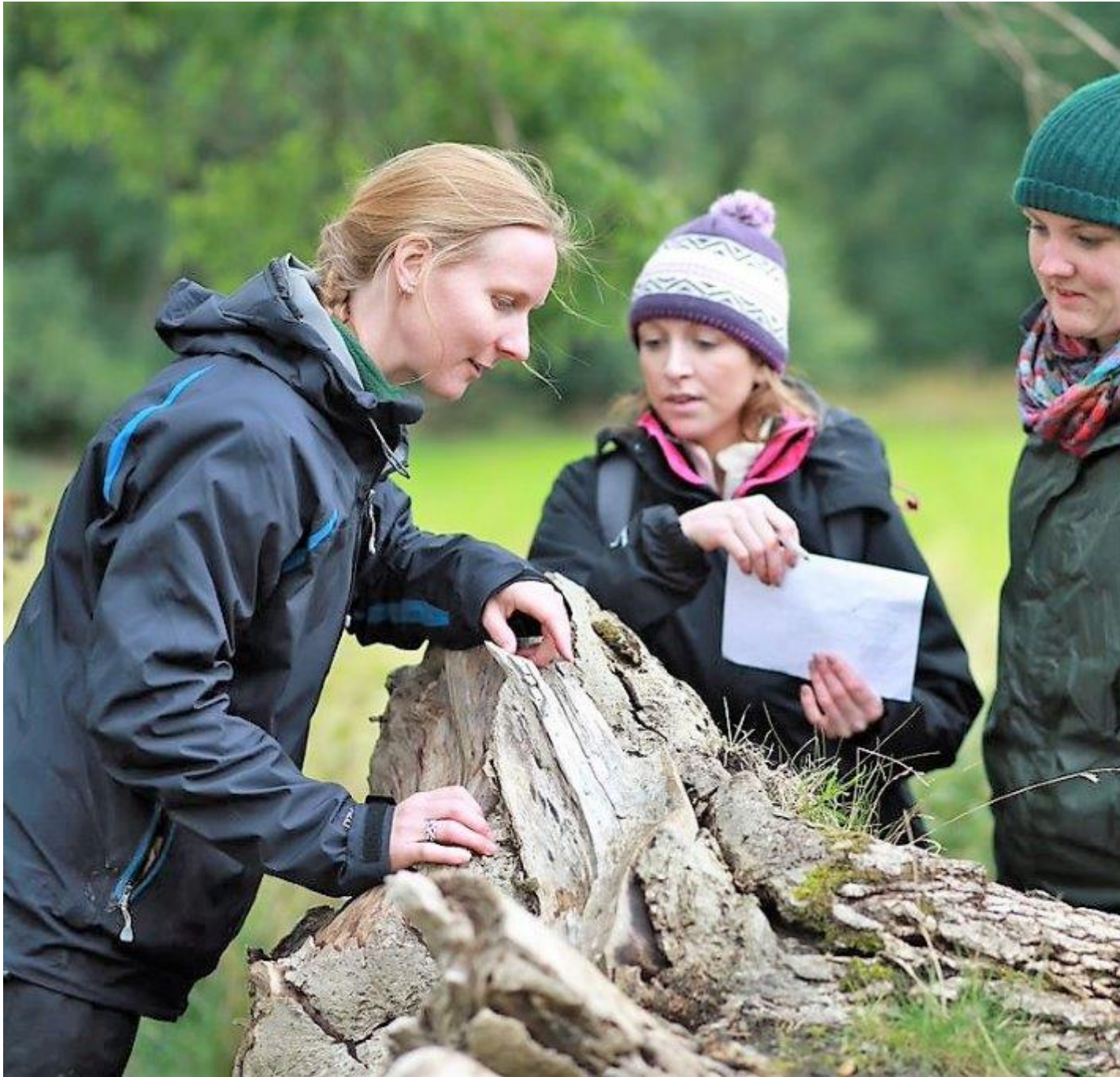
Student conservation volunteers - University of Cumbria

There will also be opportunities for families to get involved through species walks and talks, nature and art competitions and classes culminating in an exhibition.