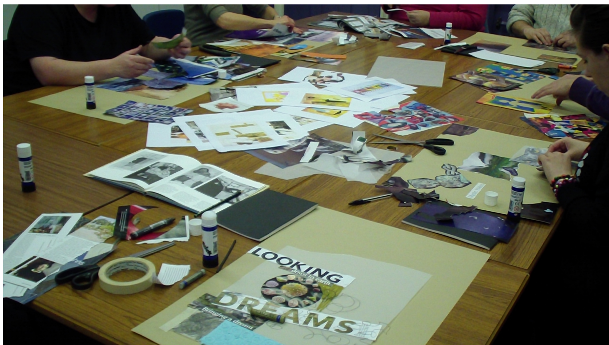
Participants get involved in an artwork