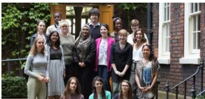
Gardeners at Lloyd Park in Walthamstow