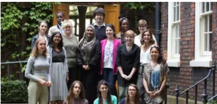
Gardeners at Lloyd Park in Walthamstow