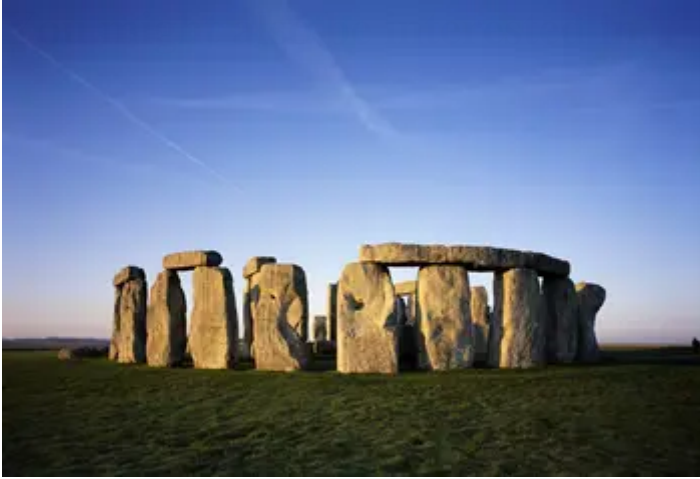
View from the east of Stonehenge at sunrise