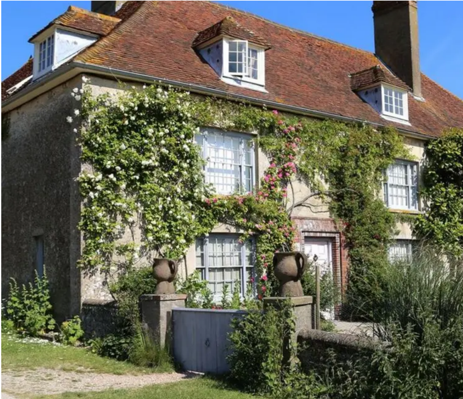
The exterior of the Charleston House

Stuck for things to do this October? Here are seven super places to visit this month - including freebies for National Lottery players.