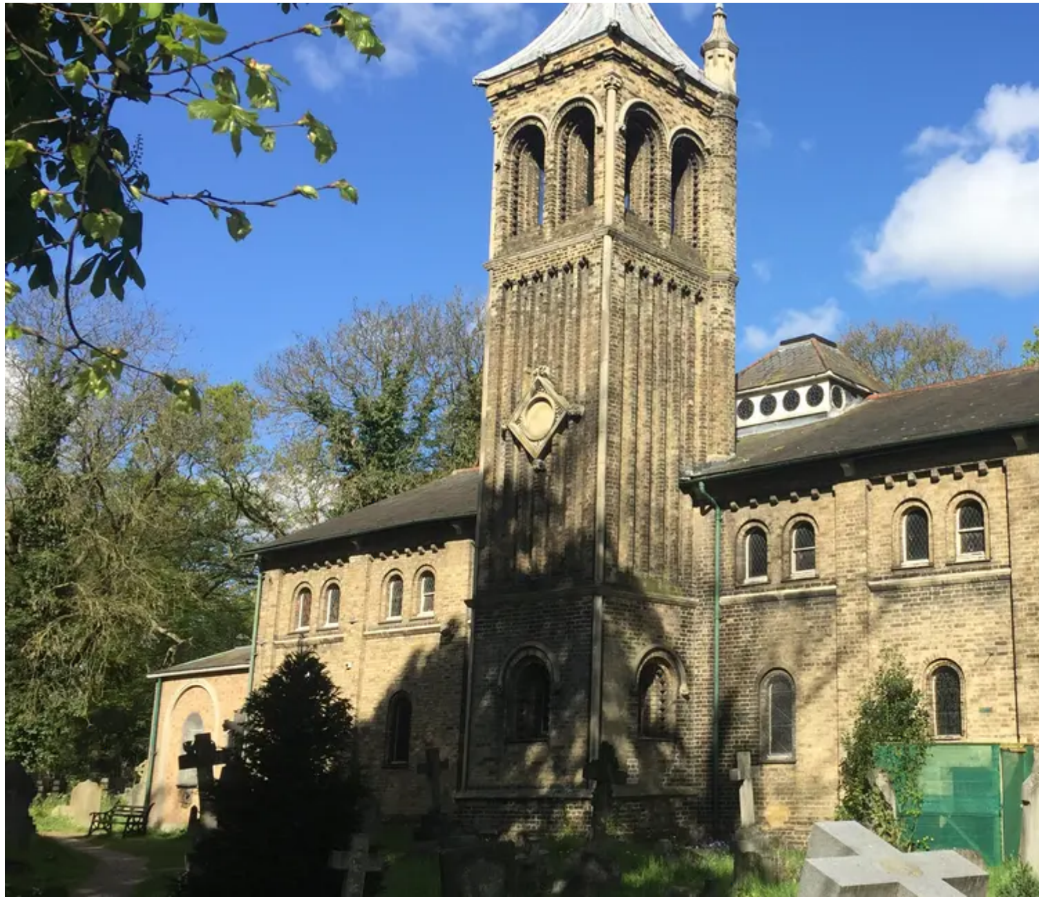
St Peter-in-the-Forest is to be remodelled so it can be used more widely by the local community Does this church hold the key to the future survival of other historic places of worship?

The parish church of St Peter-in-the-Forest, Walthamstow, is partly falling down and currently languishing on Historic England's 'Heritage at Risk Register'. But could this pretty, yet unassuming church, nestled on the edge of Epping Forest, hold the key to the future survival of hundreds, or even thousands, of other historic places of worship?