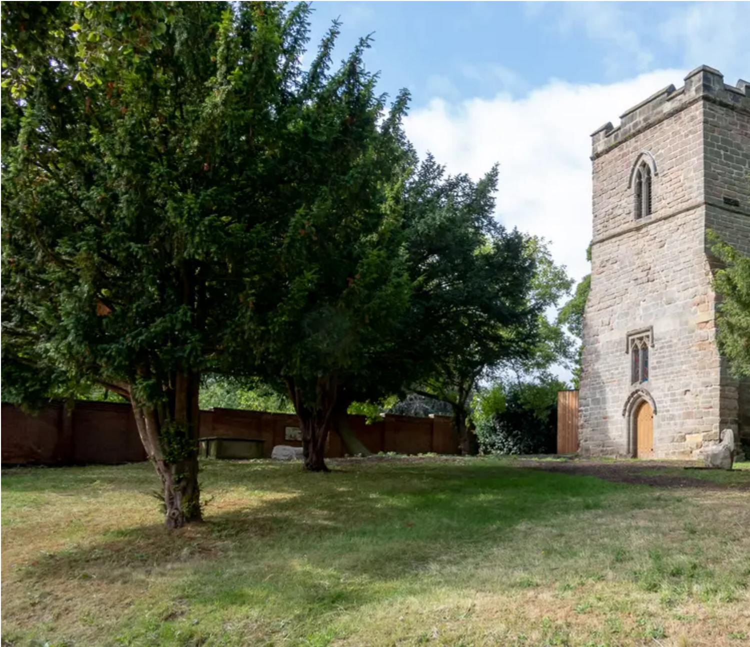
Bramcote Church Tower

Three fascinating examples of East Midlands heritage – a town hall, an ancient church tower and a First World War memorial park – are to be re-opened, following restoration projects in which they shared HLF grants totalling £3.4million.