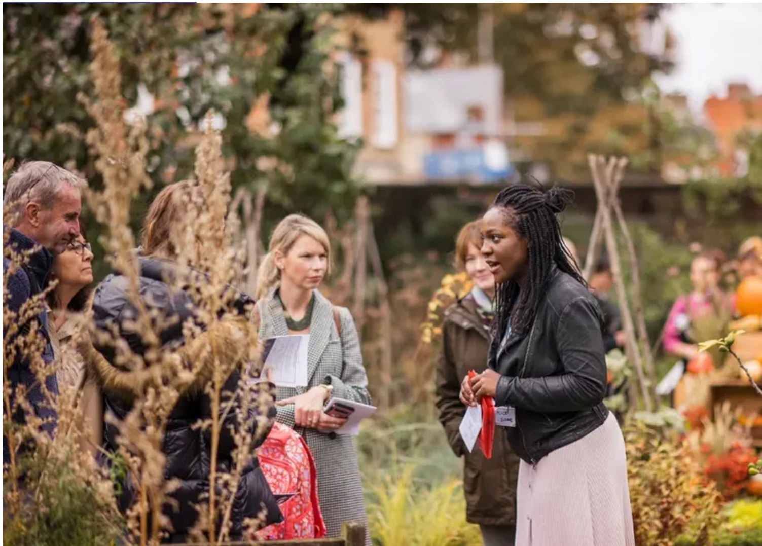
Non-executive independent members