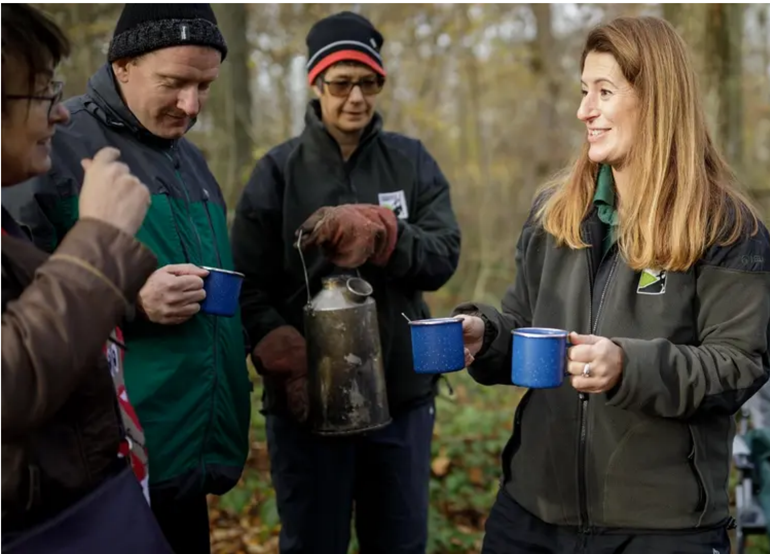
Board of Trustees

We have offices across the UK, where our teams can help you develop and run your project. Each of our nations and areas are led by directors.