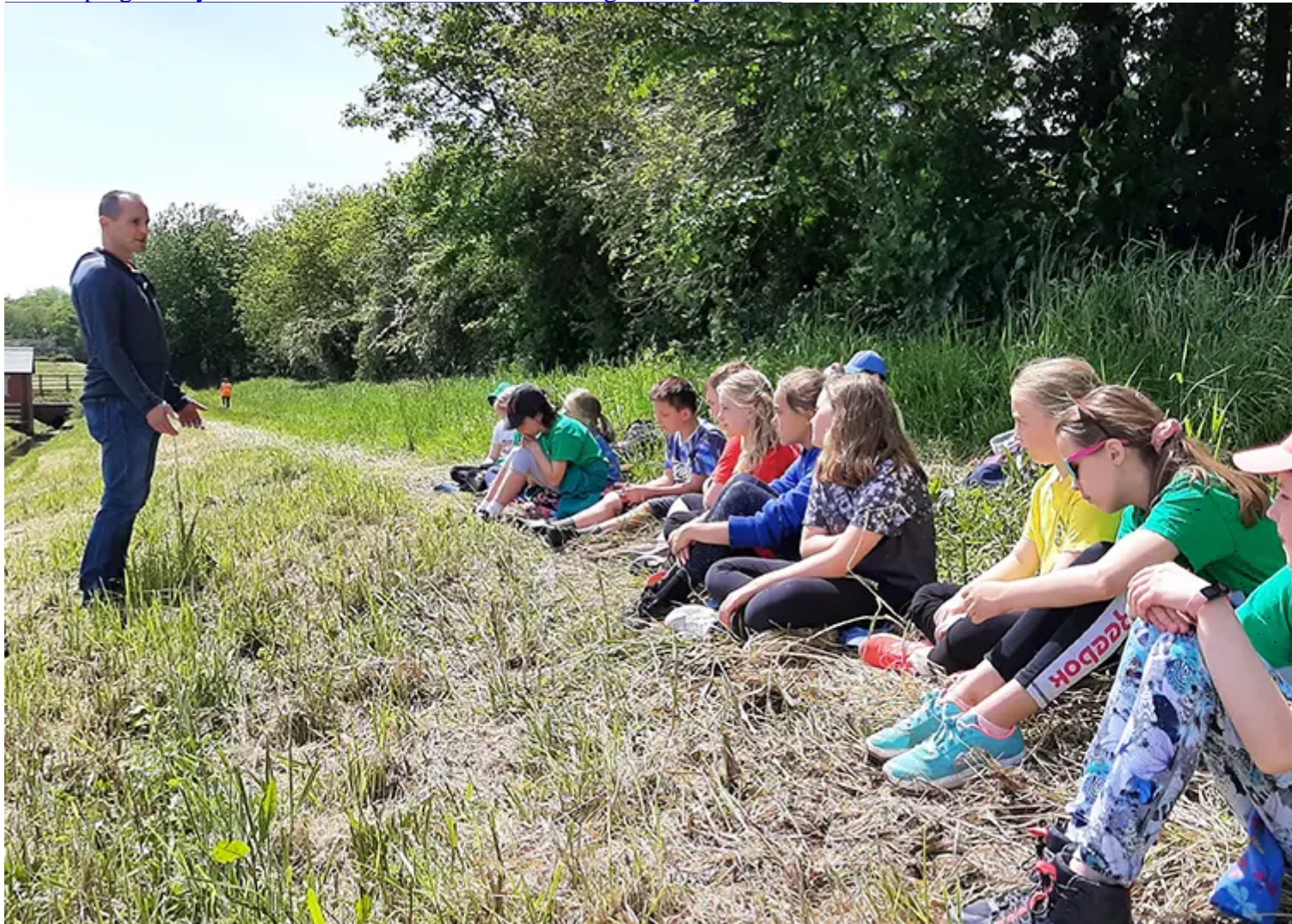
School pupils get a taste of nature in Cardiff's ancient forests