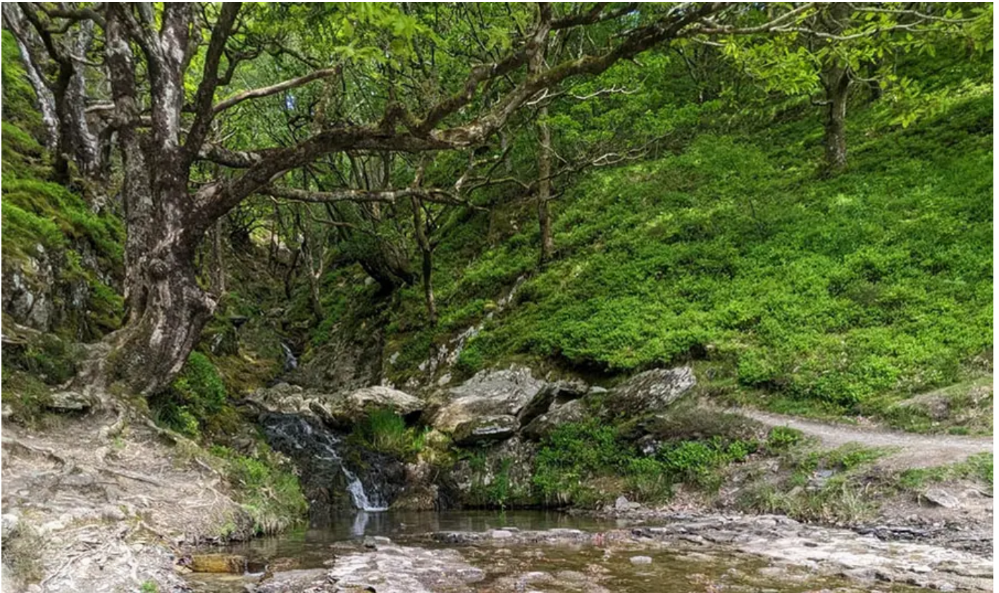
Saving rare Celtic Rainforest in the Elan Valley

Through the TWIG programme we are helping deliver on the Welsh Government's vision of creating a National Forest network which will stretch the length and breadth of Wales. The projects we fund, including the examples below, are publicly accessible woodlands and forests throughout Wales. Together they are protecting nature, addressing biodiversity loss and supporting the health and wellbeing of communities.