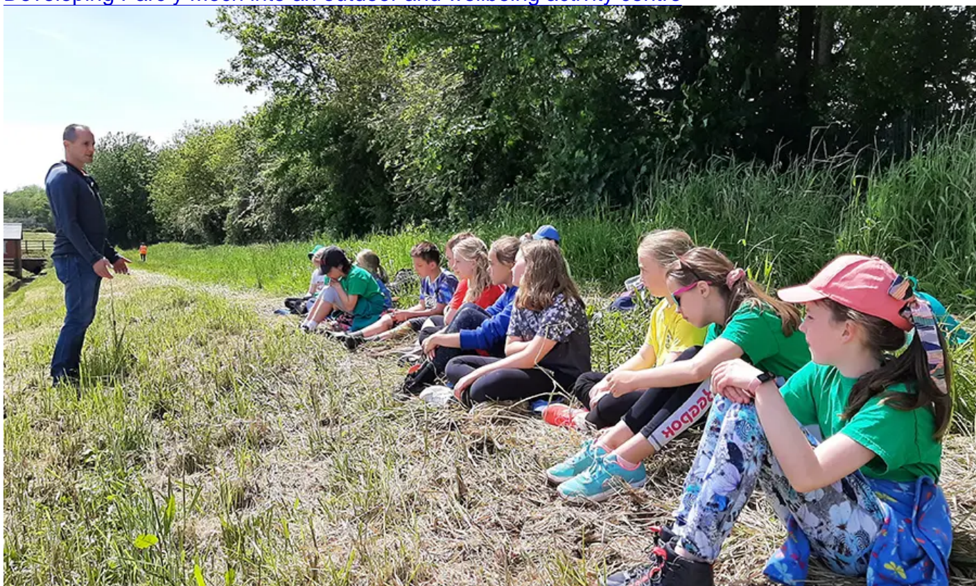
School pupils get a taste of nature in Cardiff's ancient forests