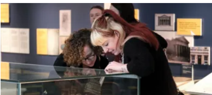
people in natural heritage