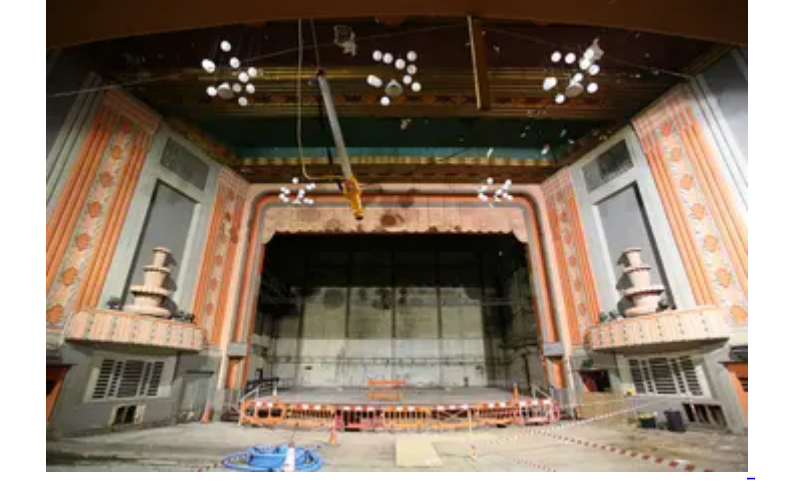
The derelict Globe theatre, Stockton-on-Tees Kippa Matthews