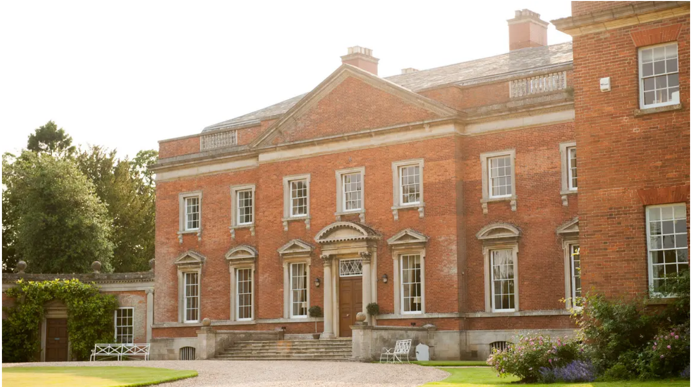
A sunny Kelmarsh Hall

Three major heritage attractions are holding free offers for National Lottery players this week.