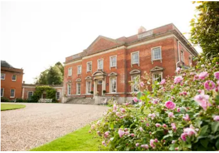
Kelmarsh Hall & Gardens