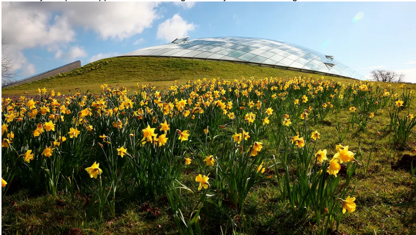
The Great Glasshouse of the National Botanic Garden of Wales