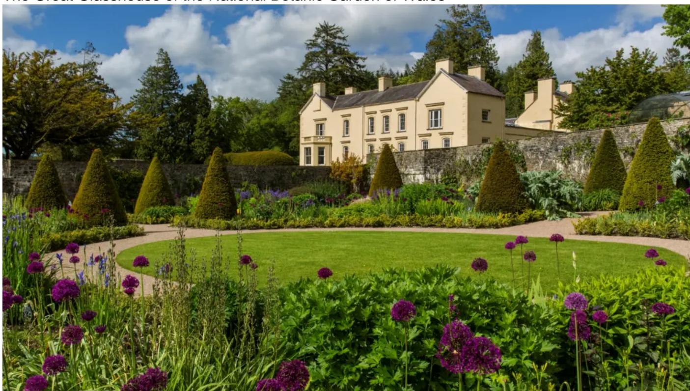
Aberglasney House and Gardens in the Tywi Valley, Carmarthenshire