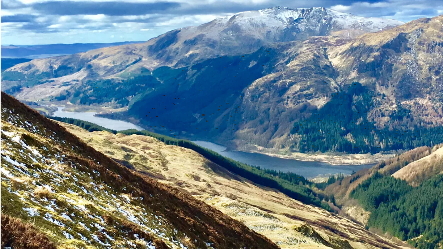
Scottish landscapes set to blossom - Ben Ledi and Loch Lubnaig Keith Wilson

The National Lottery has marked the first day of spring with an investment of over £5.6million in three large-scale Scottish landscapes from the remotest islands of Orkney to the industrial coastline of North Ayrshire.