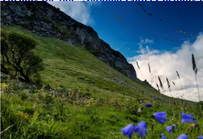
Binevenagh and the Coastal Lowlands