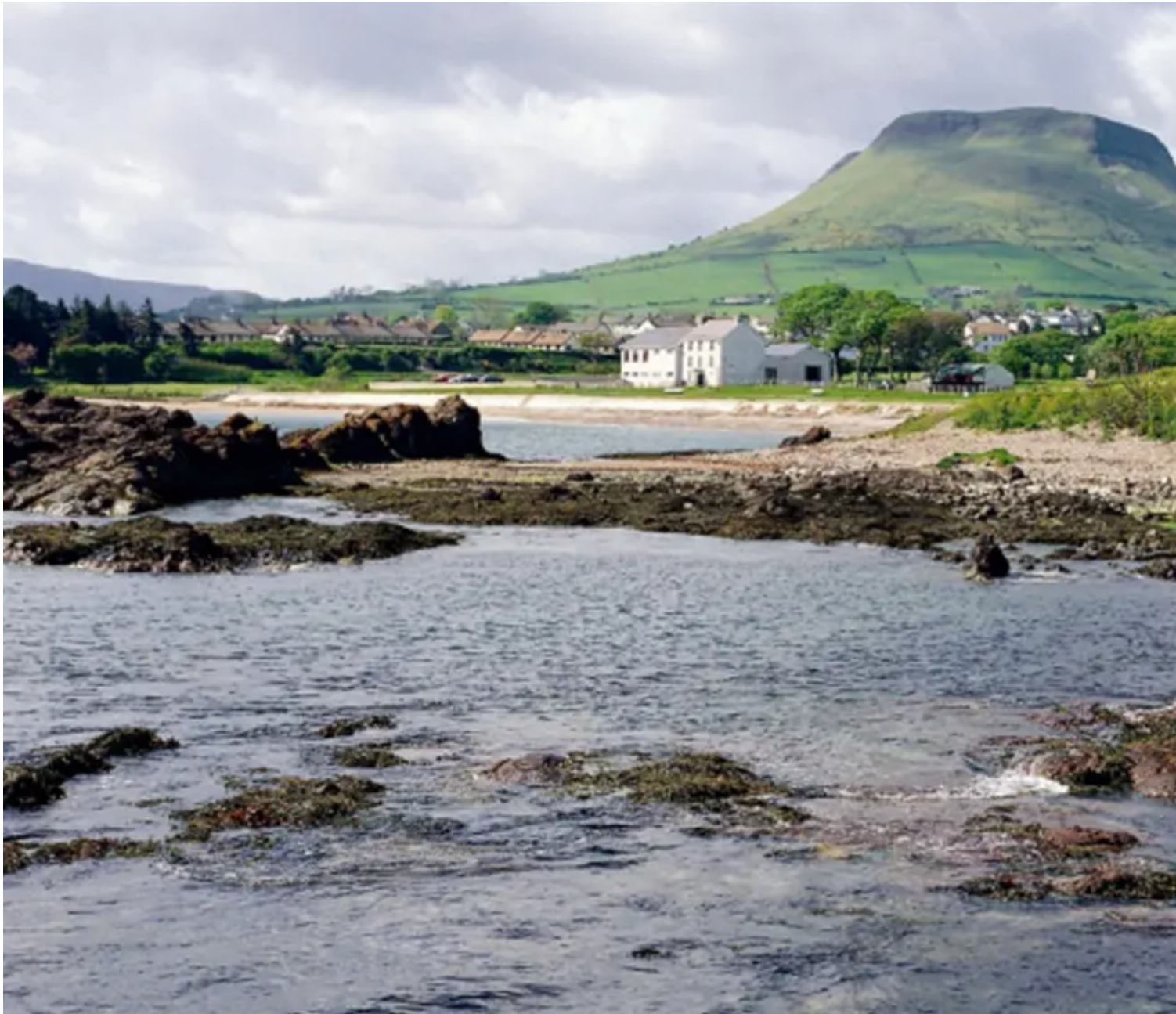
View of the Glens of Antrim

HLF has invested more than £200million in Northern Ireland's heritage. Here we look at some of the ways this support is making a difference.