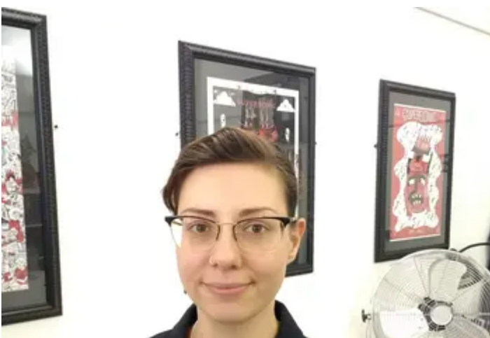
ears of repair work