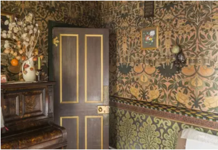
Kitchen wall design in David Parr House David Parr House

Cambridge terraced house with grand interiors set to open doors