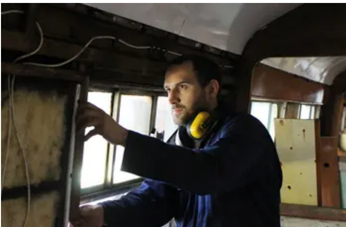
Minster's medieval masons