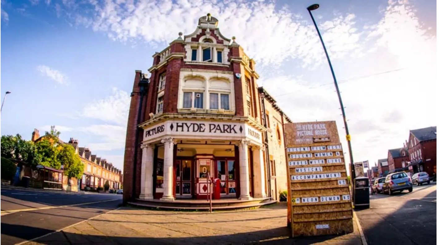
Hyde Park Picture House

William Morris' family home and a silent era cinema are among 12 projects awarded major support totalling £55million, thanks to National Lottery players.