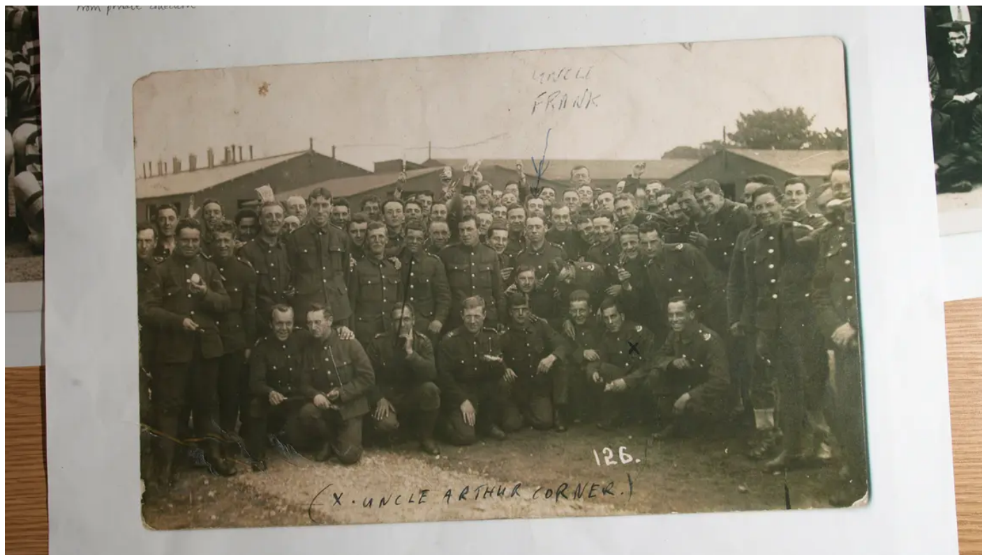
The photo from the biscuit tin

"While we might not all win the jackpot, all of us who play the National Lottery are changing lives like mine for the better – what are the odds on that?"