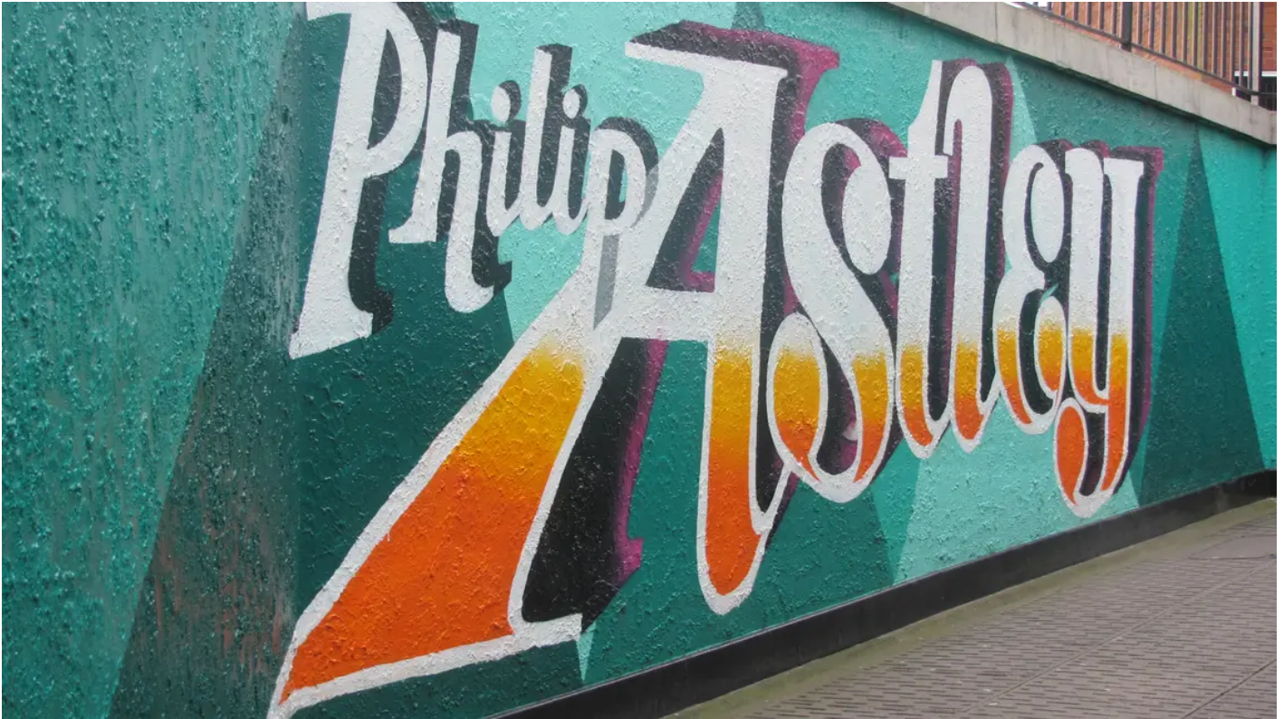
Philip Astley subway art

2018 marks the 250th anniversary of the invention of the modern circus ring by Philip Astley, born in Newcastle-under-Lyme in 1742.