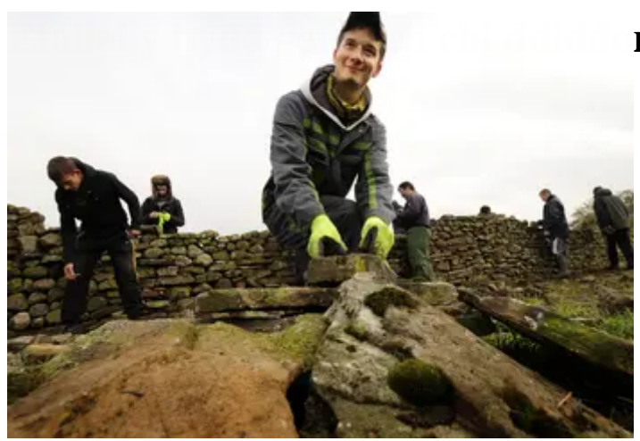
rdeb hefyd mewn ...

A trainee learns dry stone walling on an HLF project in the North West