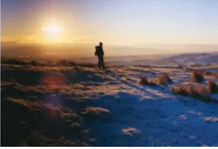
Pendle Hill at sunset Alastair Lee