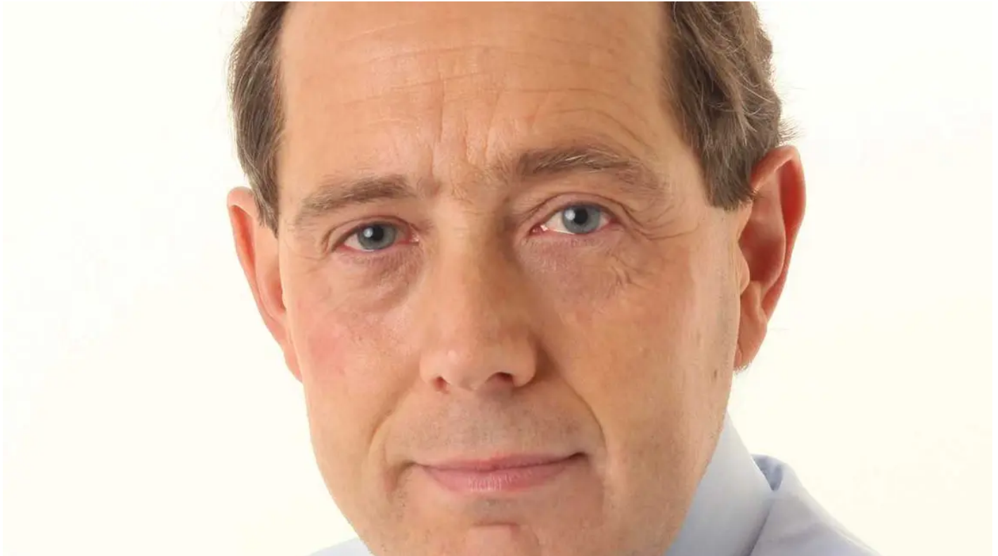
Sir Peter Luff

Our capital city is internationally renowned for its museums, galleries and landmarks but London's rich heritage can also be discovered in its landscapes, its industries and the communities which call it home.