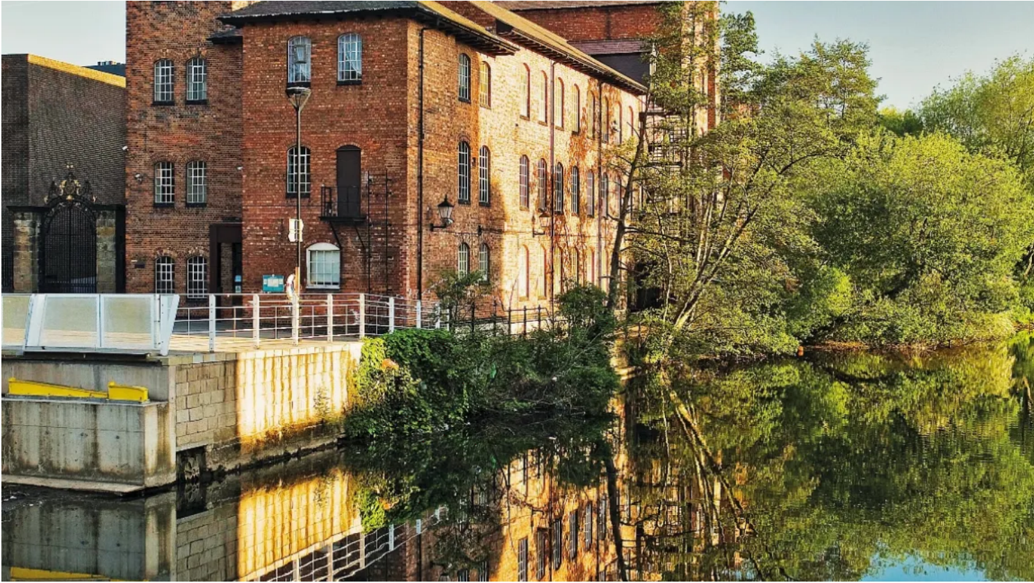
Derby Silk Mill

Part of a £98m investment in nine projects across England and Scotland, the significant grants will breathe new life into two of the region's most historic and noteworthy buildings - Derby Silk Mill, site of the world's first mechanised factory and Lincoln Cathedral, one of the finest examples of Norman architecture in Europe.