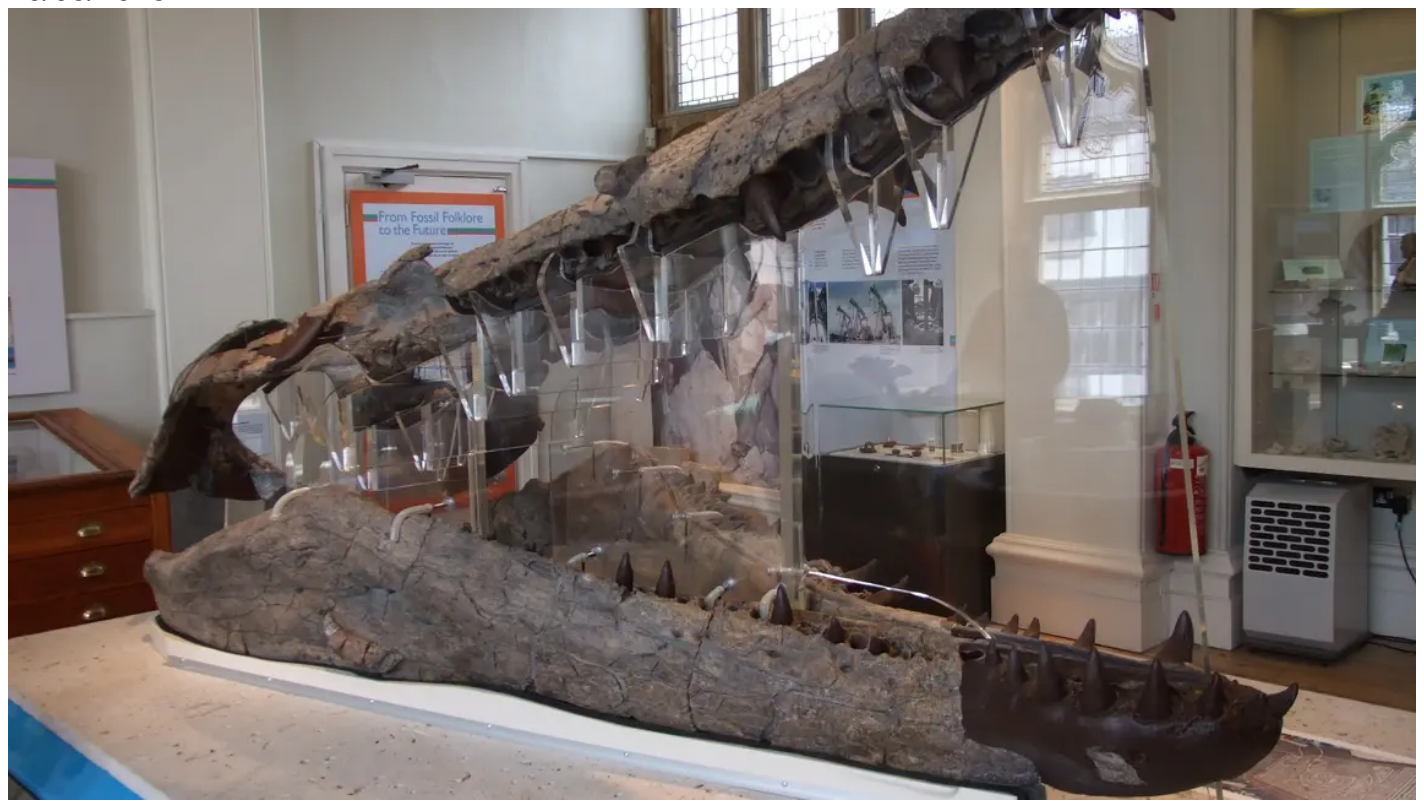
The Weymouth Bay pliosaur

The main aims of the project are to provide a new state of the art learning centre, better archive and storage facilities and better public access to displays of the Museum's vast collection.