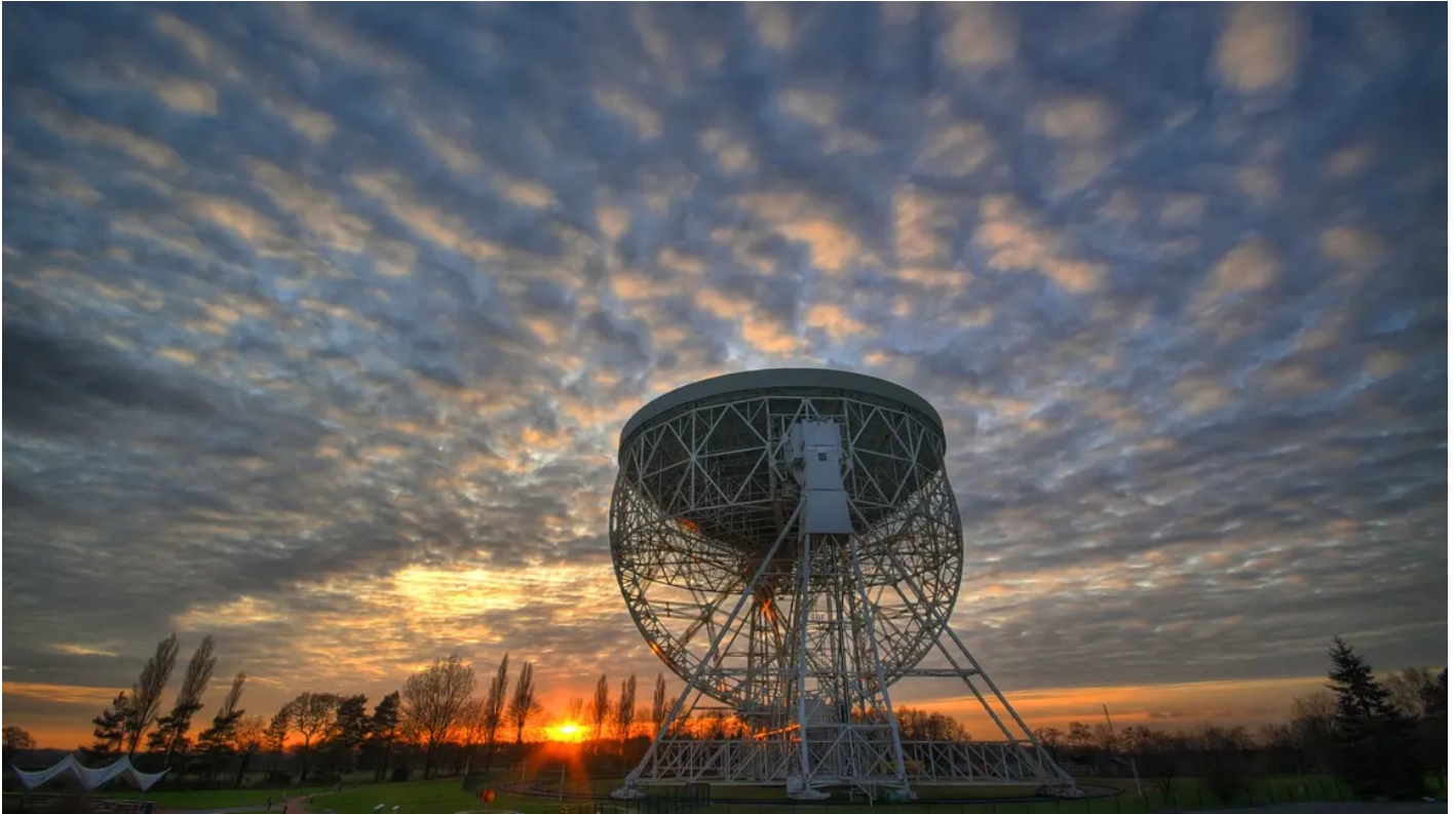
The Lovell Telescope at Jodrell Bank at sunset

Today, the Heritage Lottery Fund (HLF) has announced support worth £98m for nine major sites in England and Scotland. The stories to be told include that of the UK's ground-breaking role in science and industry from the invention of radio astronomy at Jodrell Bank to our unique railway heritage; from one of the world's earliest factories at Derby Silk Mill to the world's largest medical collection at the Science Museum. They will increase awareness and understanding of our scientific and industrial heritage, inspiring the scientists and engineers of the future.