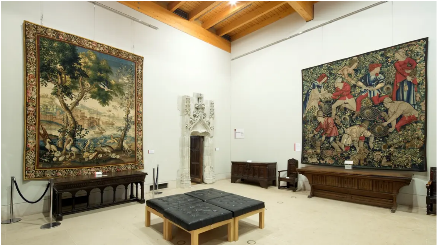
Inside one of the galleries in the Burrell Collection

Today, HLF's UK Board announced support of £15million for the transformation of the Burrell Collection including the award of a grant of £1million to assist Glasgow City Council and Glasgow Life in developing the project to the next stage of the application process.