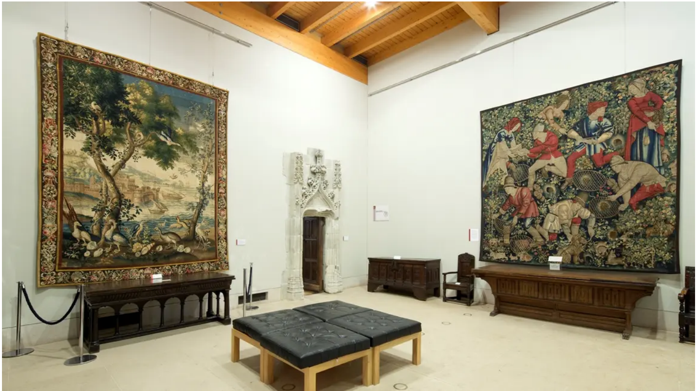
Inside one of the galleries in the Burrell Collection

Today, HLF's UK Board announced support of £15million for the transformation of the Burrell Collection including the award of a grant of £1million to assist Glasgow City Council and Glasgow Life in developing the project to the next stage of the application process.