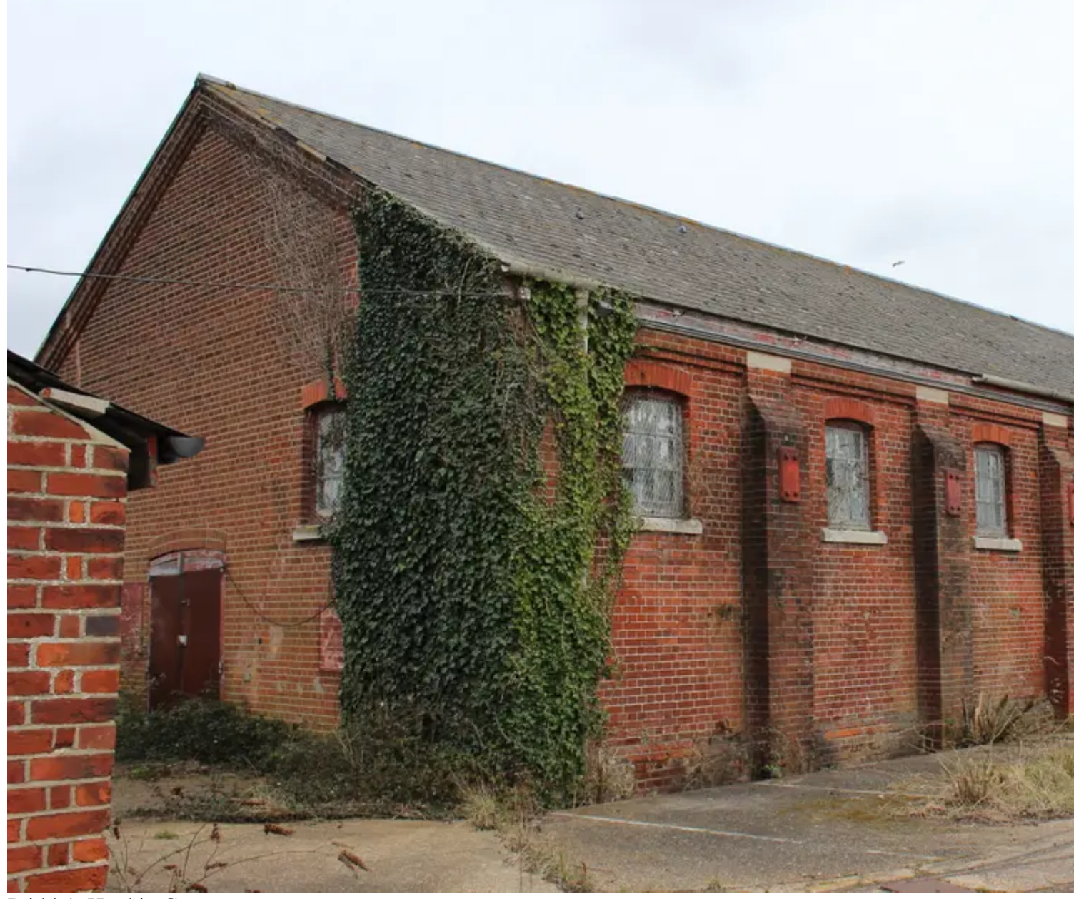
Priddy's Hard in Gosport

The grant is part of the HLF's Heritage Enterprise programme, targeting projects which create new sustainable economic uses for derelict historic buildings.