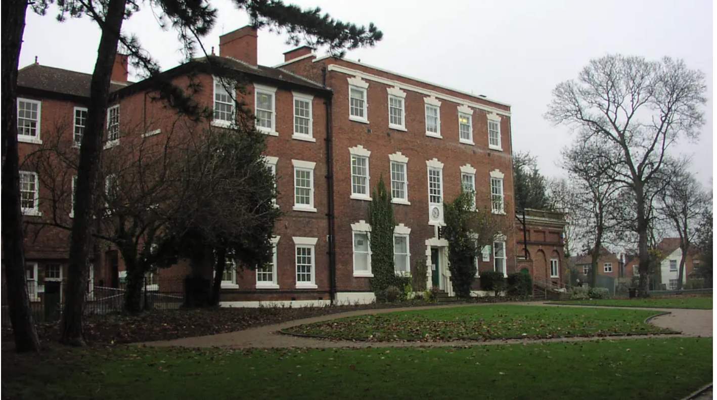
Bridgford Hall, Nottingham

Today, the Heritage Lottery Fund (HLF) is announcing grants totaling £3.3million that will make three vacant and derelict historic buildings commercially viable, putting them back to business use.