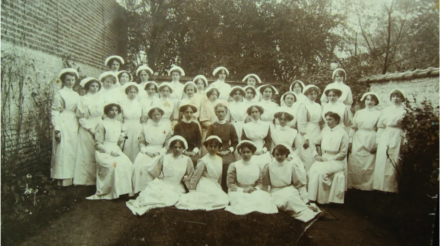
Edith Cavell (2nd row from the front, 4th from the left) at the nurse training school she ran in Brussels around 1912

A First World War nurse and pioneer of modern nursing, Cavell was executed in 1915 by occupying forces for her role in helping over 200 allied troops escape Belgium.