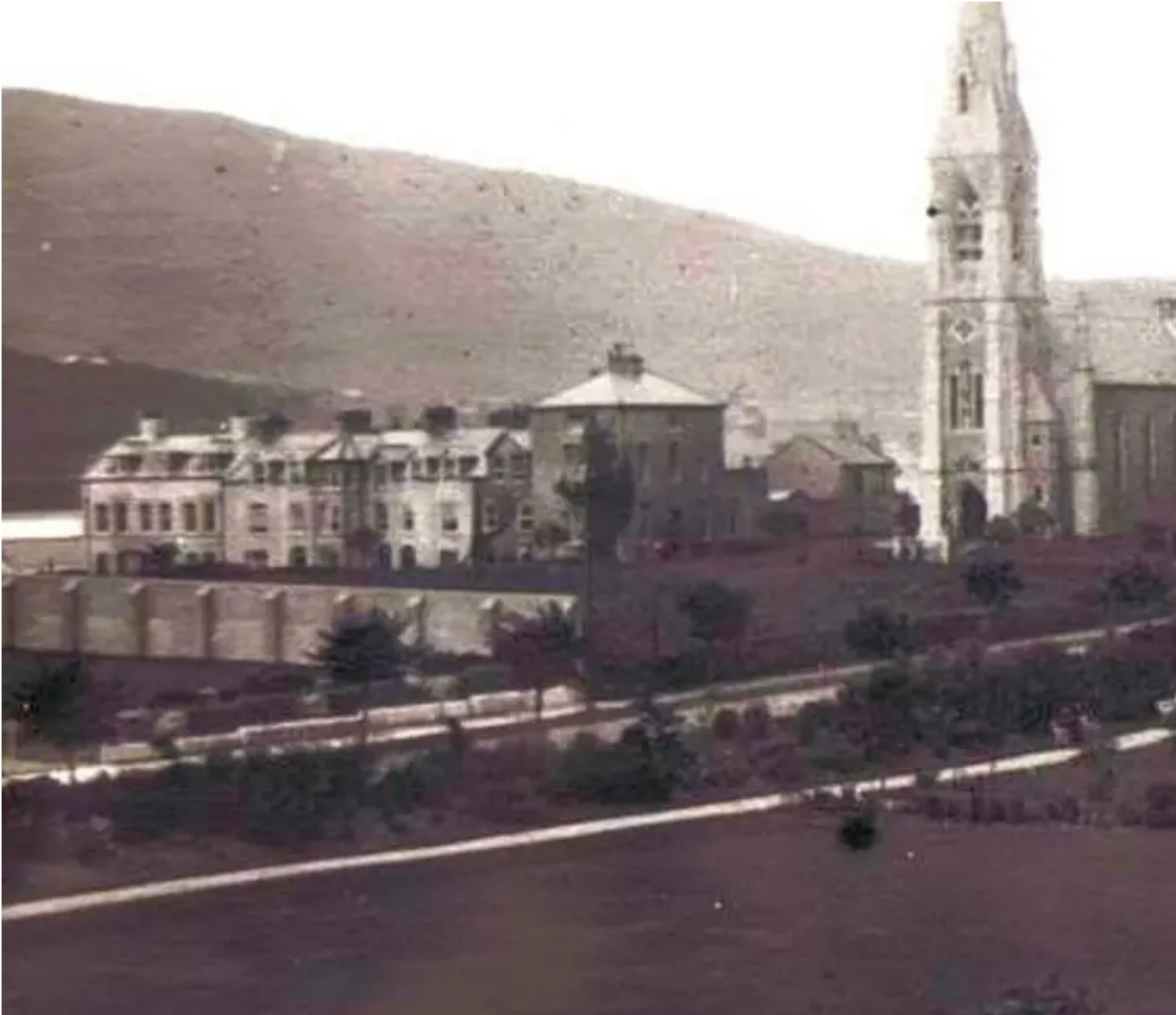
Warrenpoint Park Circa 1915

The ambitious proposals from Newry and Mourne District Council to restore the Victorian park to its former glory have received a £932,000 grant through the Heritage Lottery Fund's (HLF) Parks for People programme.