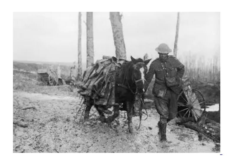
Birthplace of the 'welly' to kickstart regeneration thanks to HLF