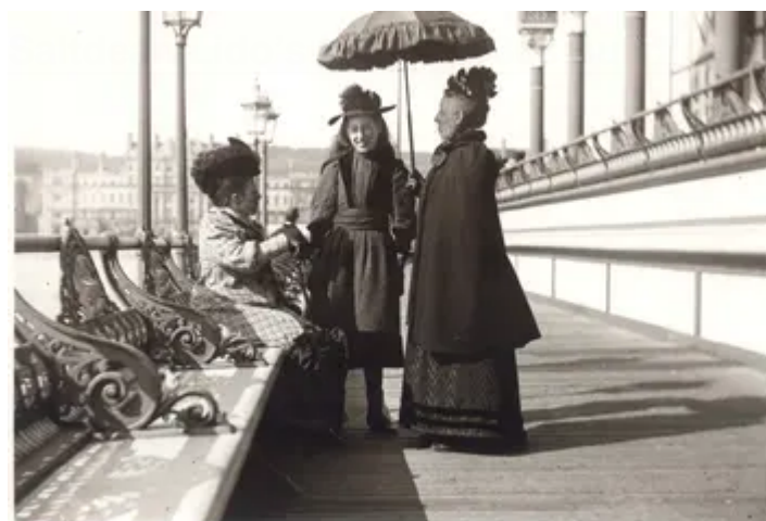
Restored for the community

Saltdean Lido at night.