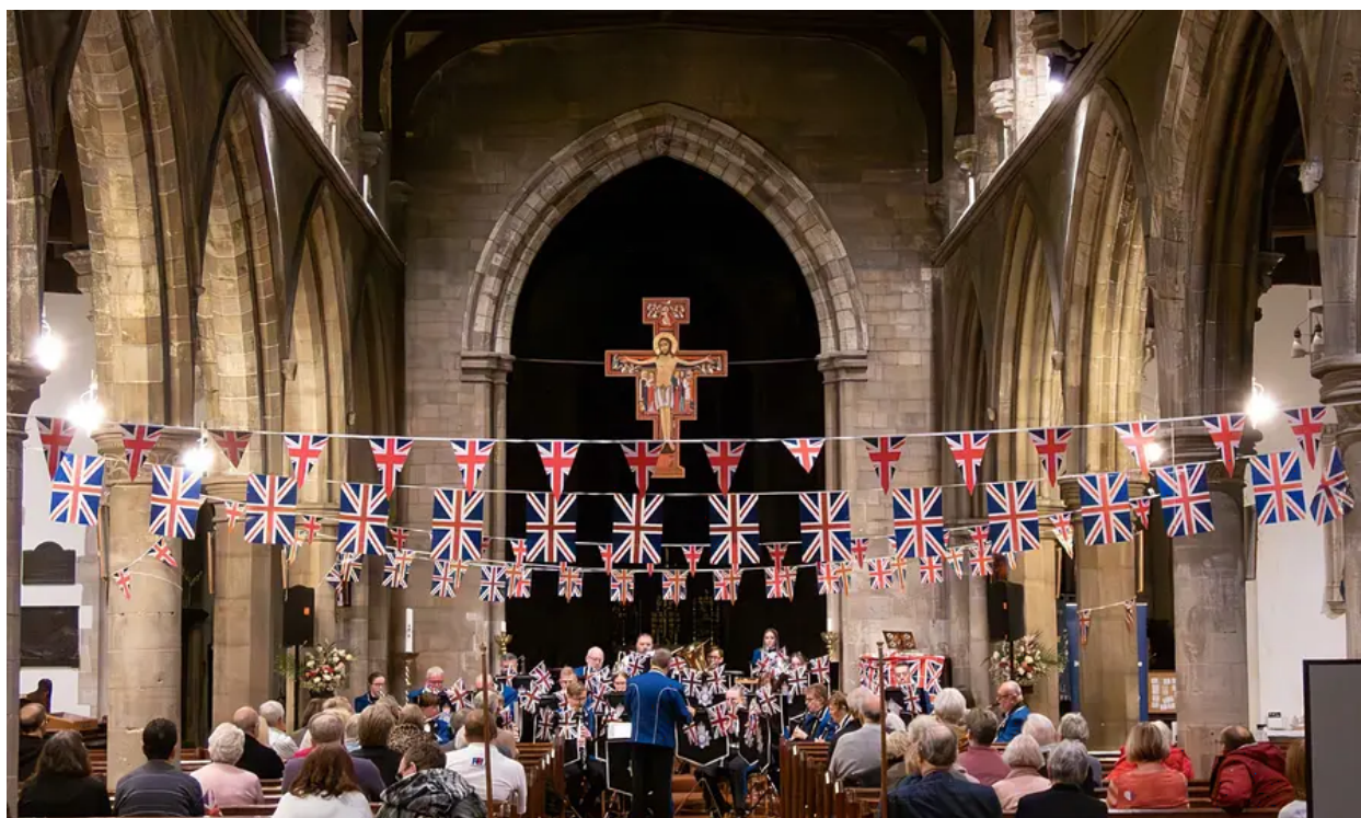
A brass band concert takes place in All Saints Hessele.