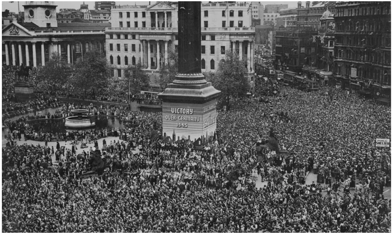
Public celebrations of VE Day in Trafalgar Square, May 1945.

Today (8 May 2025), events are taking place across the UK to commemorate those who served in the Second World War. Our investment will help both museums engage audiences of all ages and backgrounds to make sure this history is never forgotten – from the RAF Museum Midlands's oldest Spitfire in the world to the National Museum of the Royal Navy's LCT 7074, the last surviving landing craft tank from D-Day.