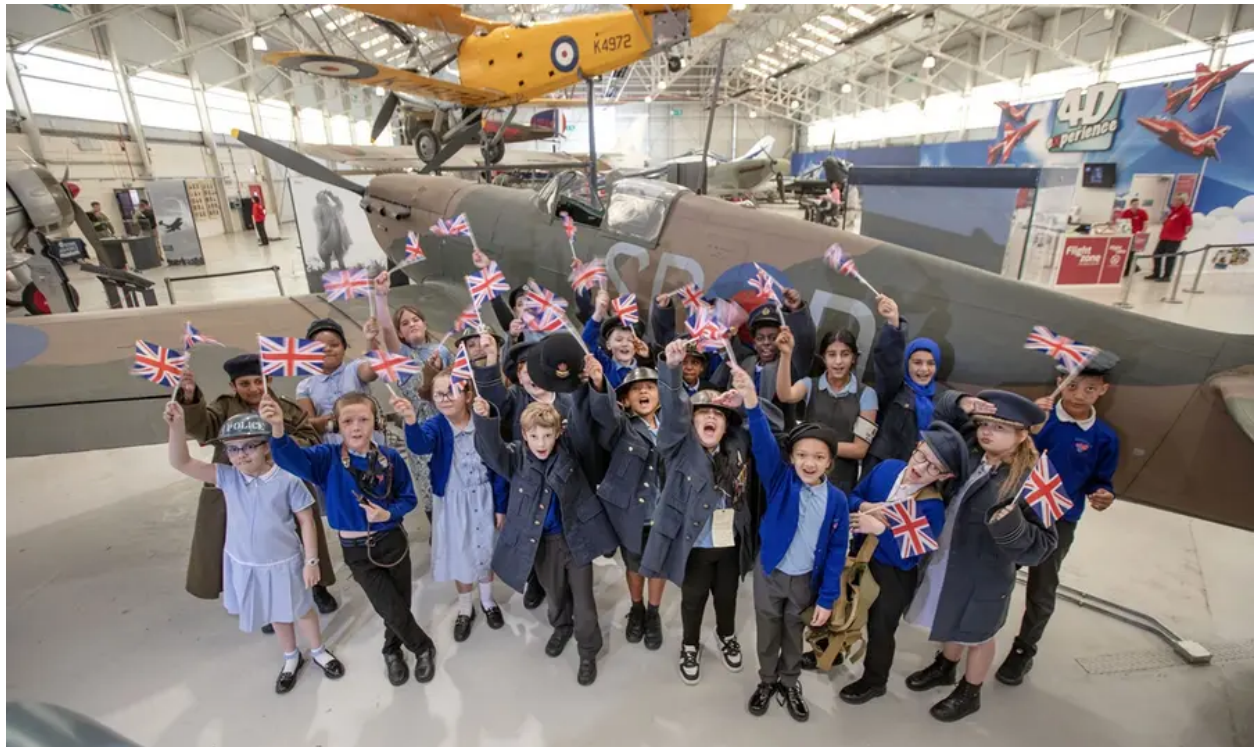
A group of schoolchildren mark the 80th anniversary of VE Day during a visit to RAF Museum Midlands.

Royal Marines Experience, Portsmouth will create a new visitor attraction in the refurbished Boathouse 6 at Portsmouth Historic Dockyard. The move will reunite its collection for the first time since 2017, allowing it to tell the story of four centuries of Royal Marines history, from the creation of its forerunner in 1664 to today.