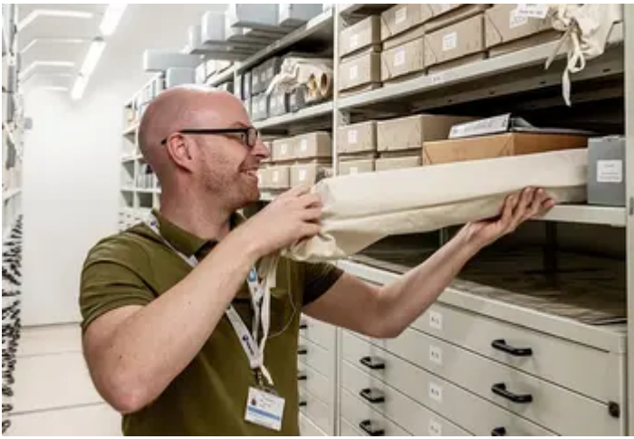
Liverpool Record Office.