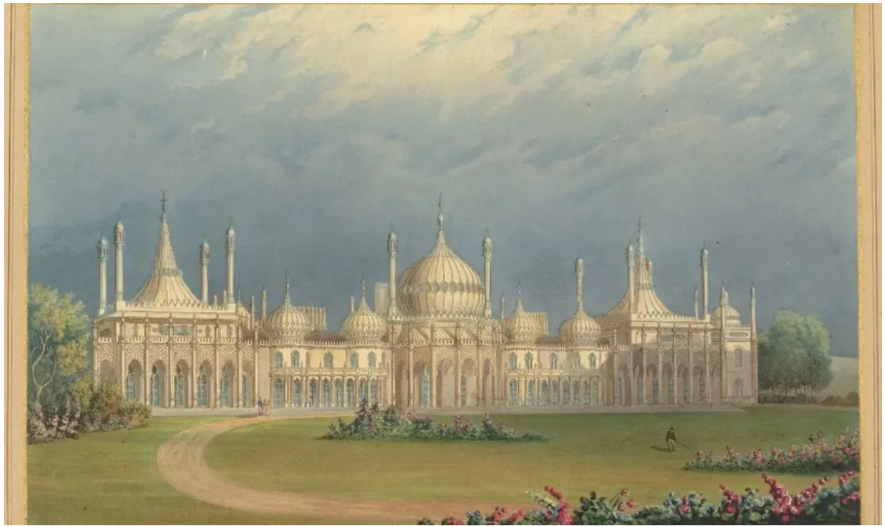
A painting of the Brighton Pavilion in the 19th century.

The successful cataloguing projects are: