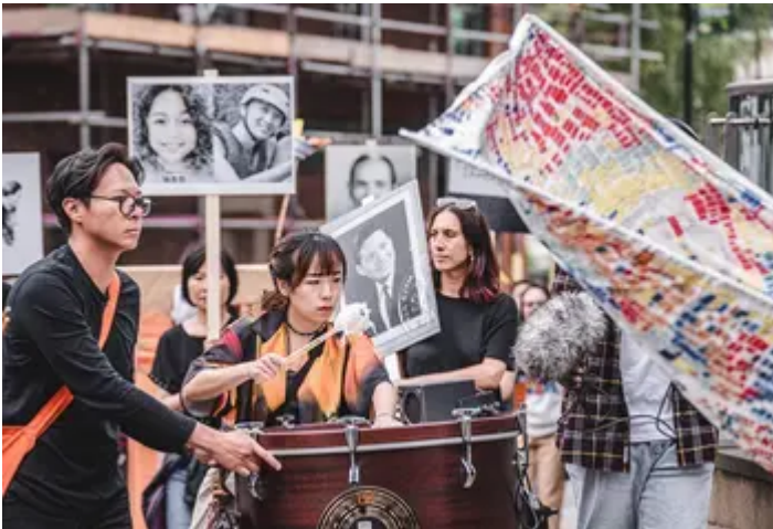
s awarded £5million