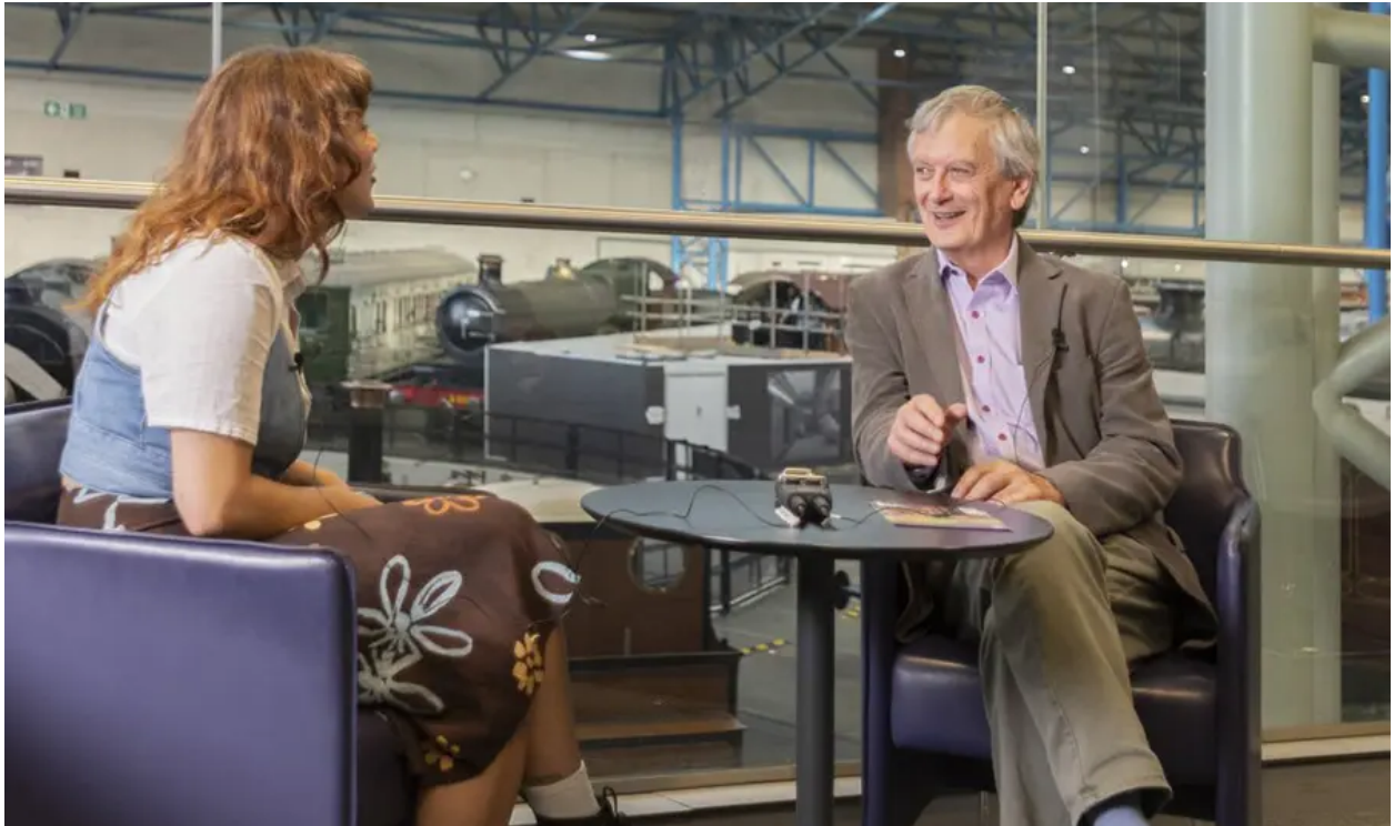
Recording an oral history.