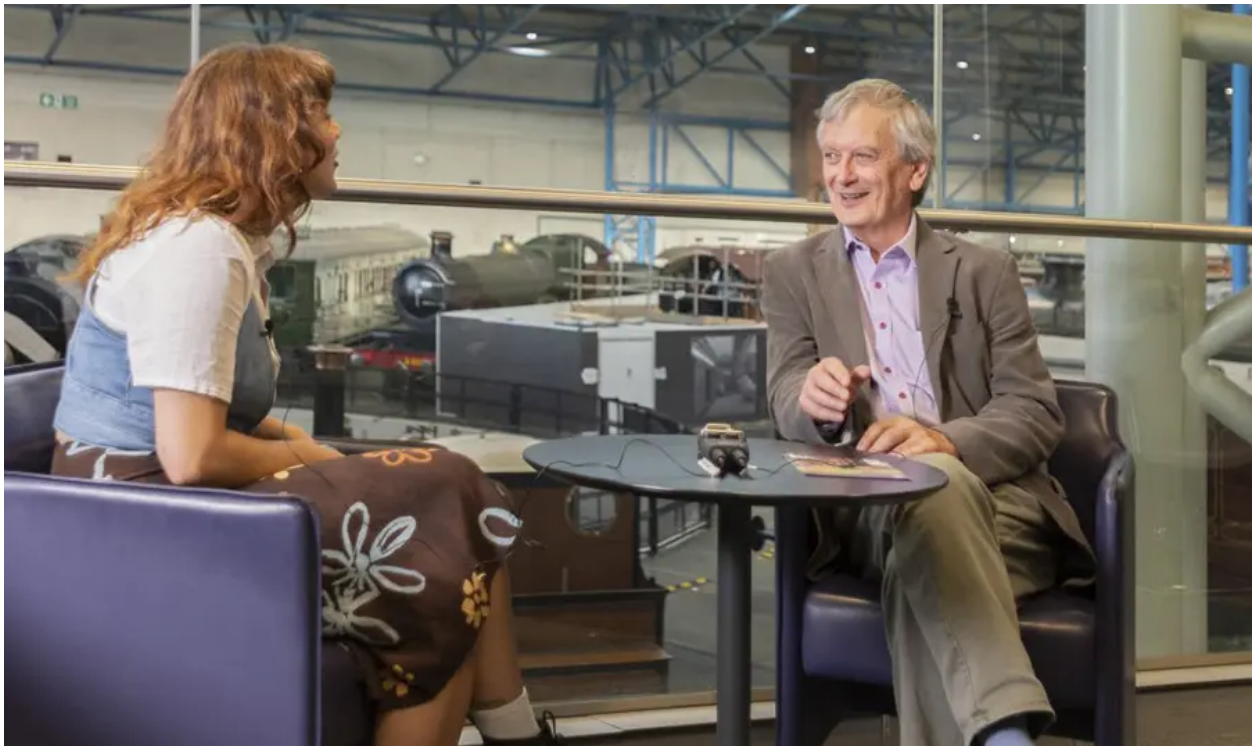
Recording an oral history.