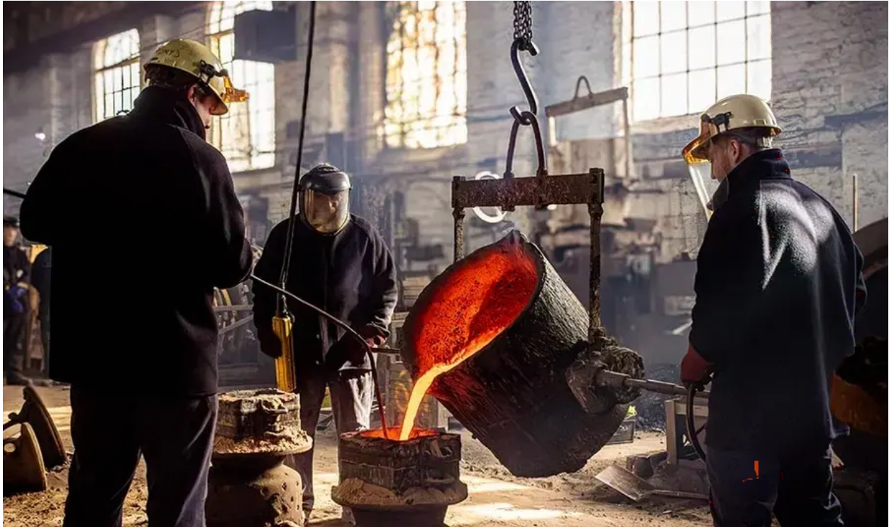
Casting a bell at Taylor's Bellfoundry.

community hub with spaces for wellbeing, retail and events.