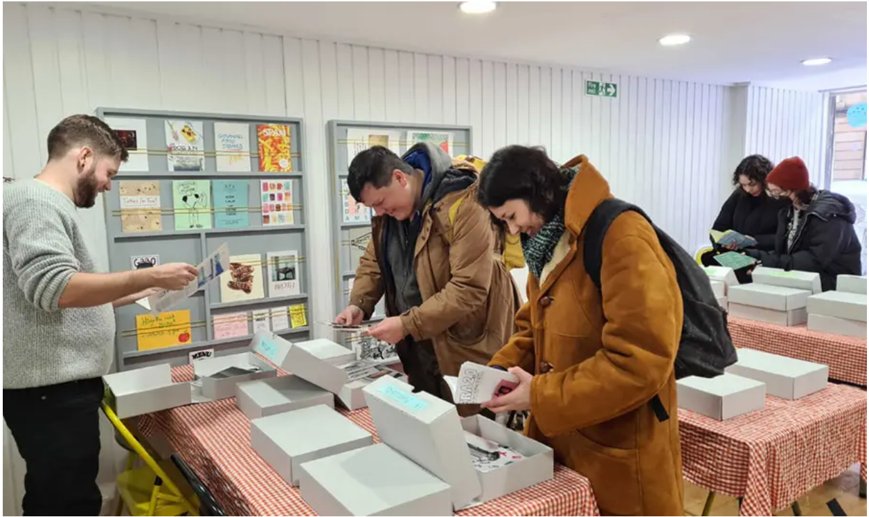
Visitors exploring zines at an open day at Glasgow Zine Library.

Glasgow Zine Library is not only saving and sharing heritage but also supporting the production of it for the future. Alongside collecting zines and bringing the stories captured in these self-made publications to new audiences, the library is inspiring more people to get involved in zine-making.