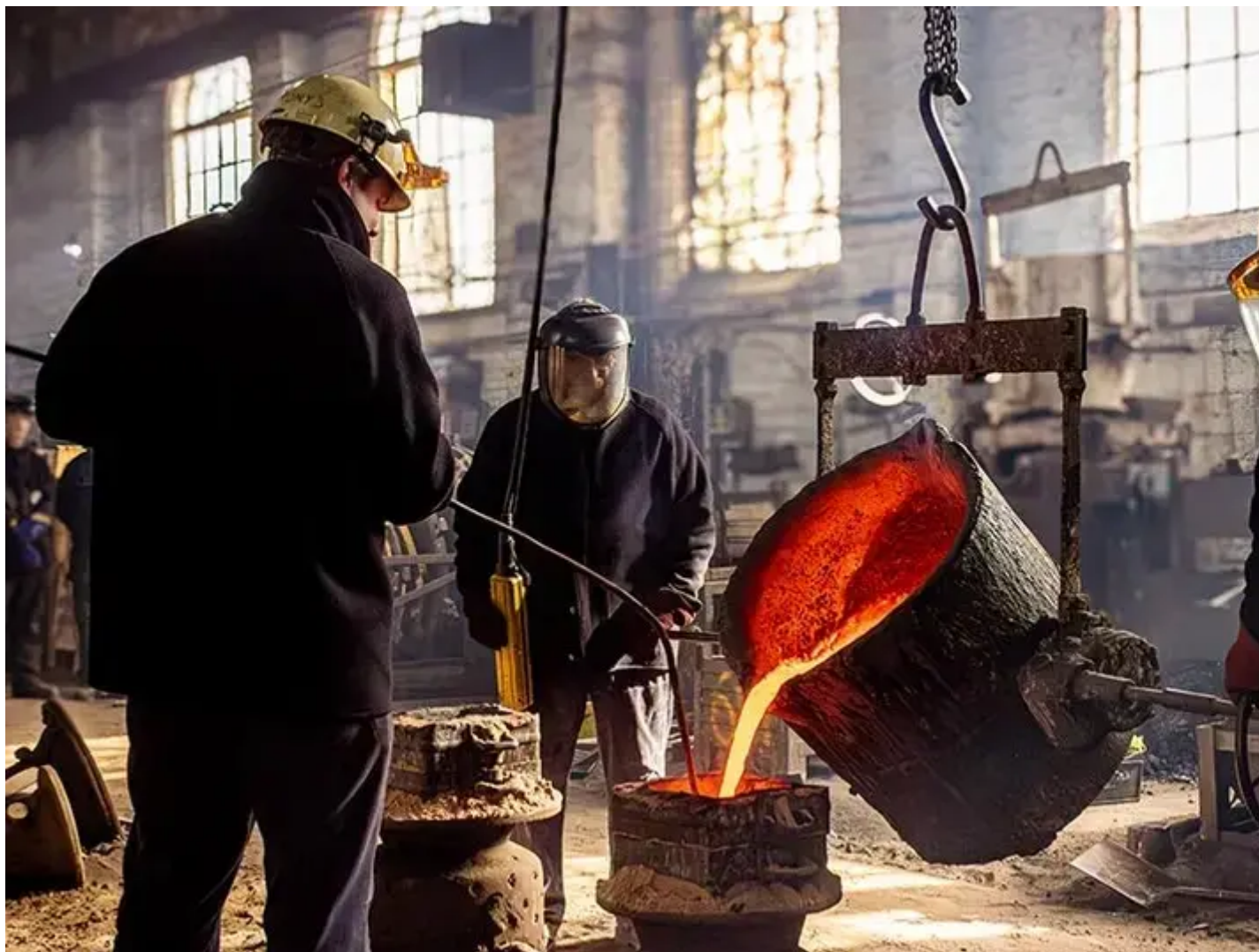
Casting a bell at Taylor's Bellfoundry.

The Delapré Abbey Preservation Trust is securing a sustainable future for the Grade II* listed country house and park by transforming a disused 19th-century stable block into a thriving community hub with spaces for wellbeing, retail and events.