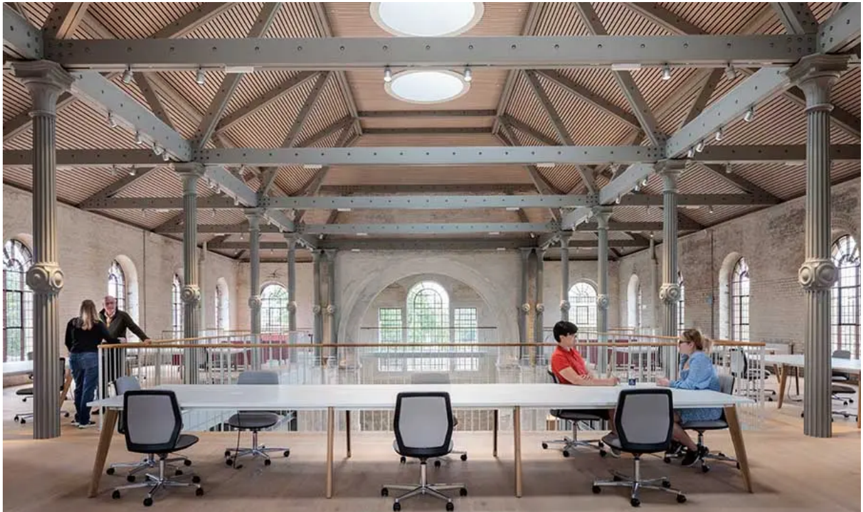
The new co-working space at Sheerness Dockyard Church.

asset at the heart of the community. Its successful revitalisation as a mixed-use public space for events, meetings and co-working has proved that investment in neglected heritage can have major economic as well as cultural and social benefits.”