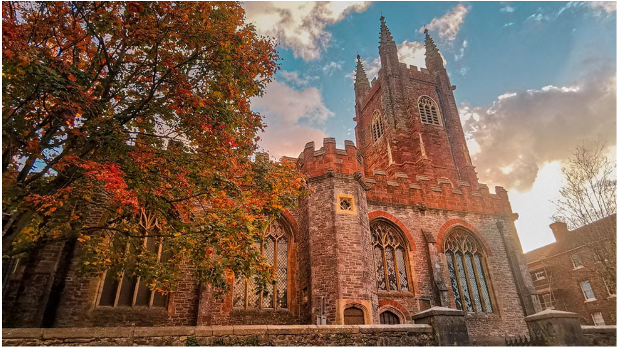
St Mary's Church in Totnes will power their new heating system using renewable energy.

St Mary's Church in Devon (awarded £965,000) will become an inviting, lively and accessible hub for the local Totnes community. The project will repair the building, install a new heating system and create a flexible space for community activities. A three-year activity programme will welcome people into the church and provide training opportunities like WEA employability courses.