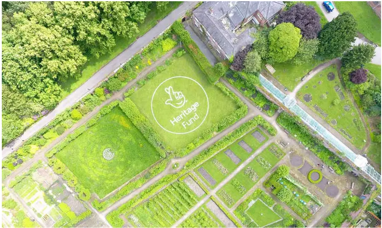
Croxteth Hall and Walled Garden's impressive entry.

Using biodegradable materials, the team at Croxteth Hall and Walled Gardens created an 18m depiction of our acknowledgement stamp on the lawn.