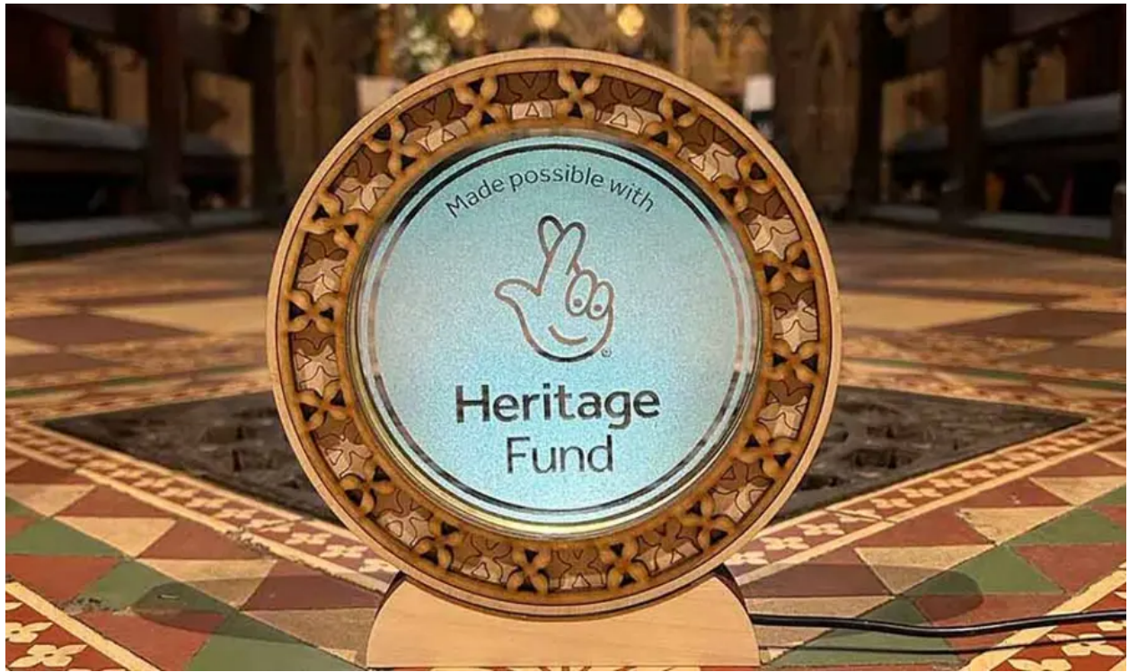
St Mary's Church, Shrewsbury's prizewinning acknowledgement plaque.

The judges were blown away by the creativity shown in St Mary's Church, Shrewsbury's entry to the competition. Designed to match the historic Grade I listed building, the acknowledgement stamp has been laser-etched onto glass and fitted into a birch ply laser-cut frame.