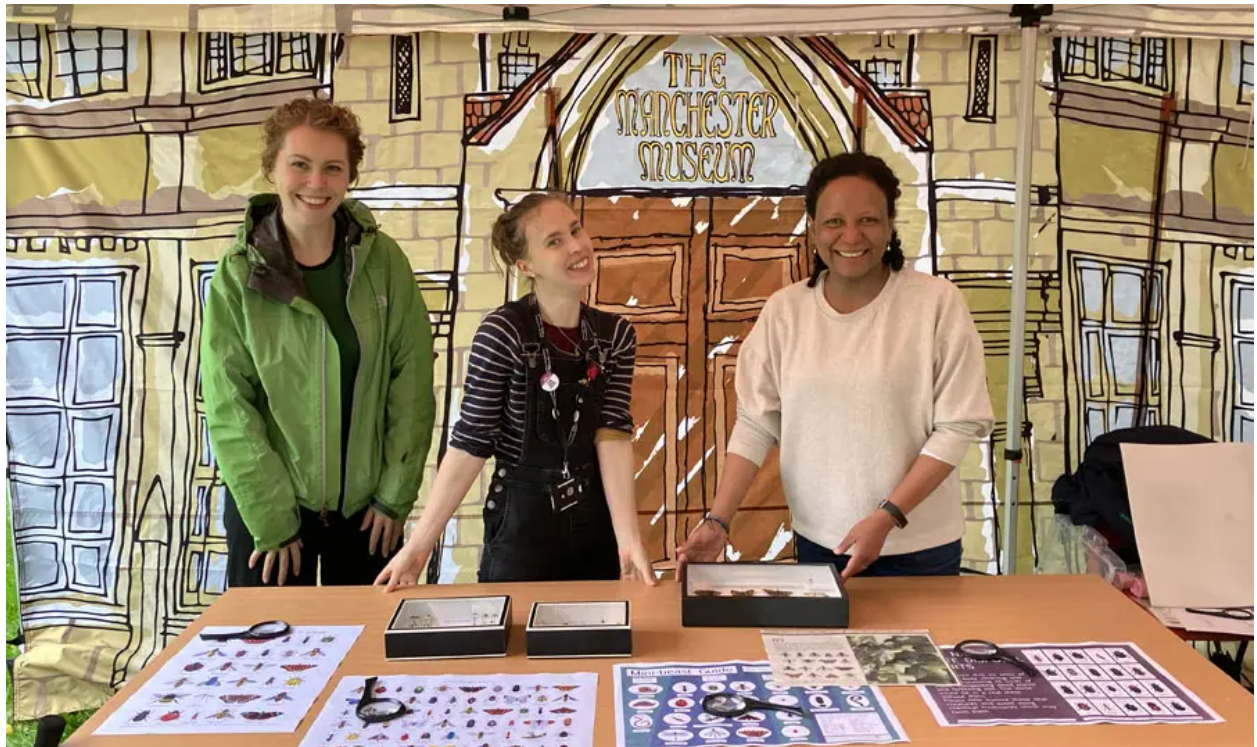
Manchester Museum staff on their pop-up stand at Ardwick Climate Action Day.

Knowledge sharing is at the heart of this initiative and the judges were impressed by the huge impact it has had, and continues to have, on the heritage sector. The panel said: "It's a rallying call to action for all museums!"