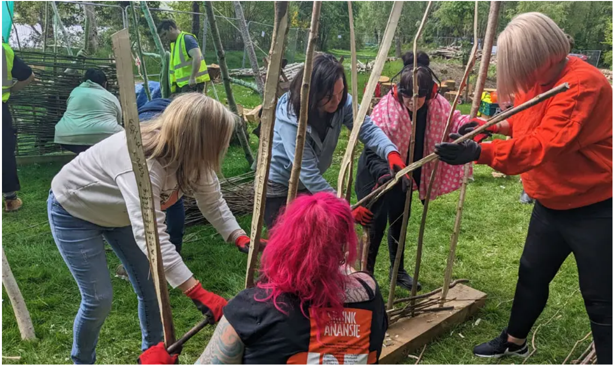
A key component of an Iron Age roundhouse is a basket frame structure for the roof made from hundreds of hazel rods.

The judges were impressed by the creative and inspiring way this organisation is engaging in climate changes. The panel commented: "It is strongly rooted in place, and has embedded sustainability throughout."