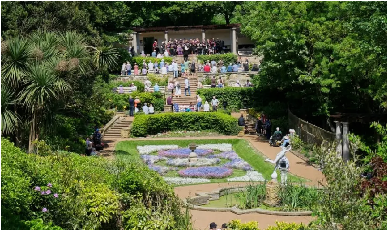
South Cliff Gardens.