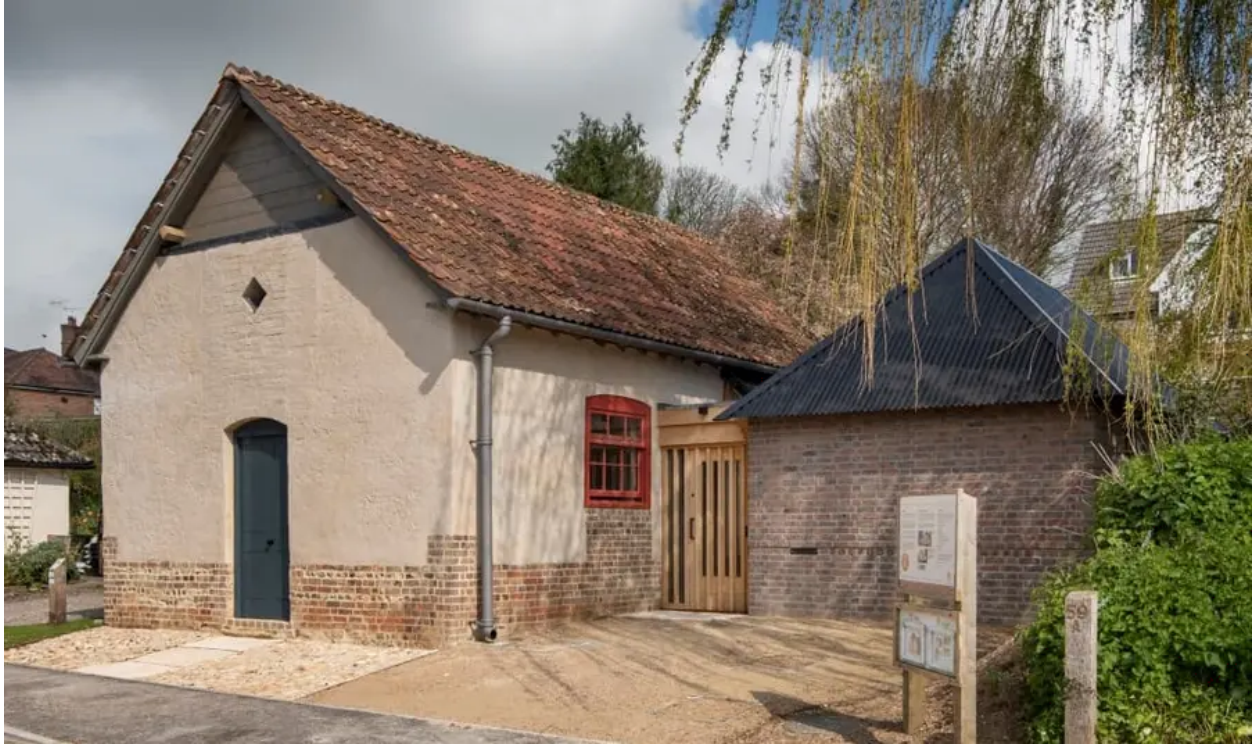
Tolpuddle Old Chapel.

“Saving heritage at risk so that it can be valued, cared for and sustained for everyone, now and in the future, is core to our purpose, and we’re incredibly proud to have been able to support the important work to make this fantastic news possible.”